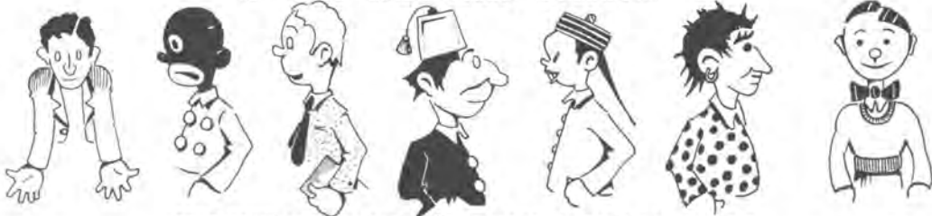
WASHINGTON HIGH'S LEAGUE OF NATIONS