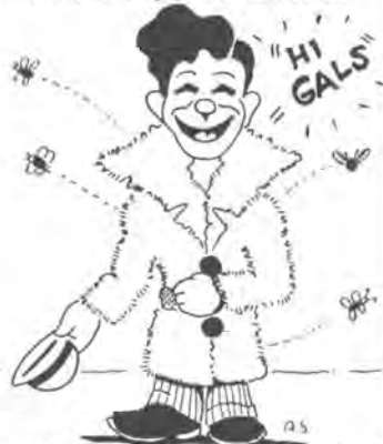
AND HIS IMPORTED FUR OVERCOAT