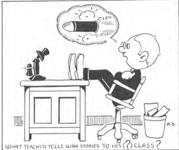
WHAT TEACHER TELLS WAR STORIES TO HIS (?) CLASS?