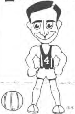
DOES HE STILL WORRY ABOUT HIS NOSE?