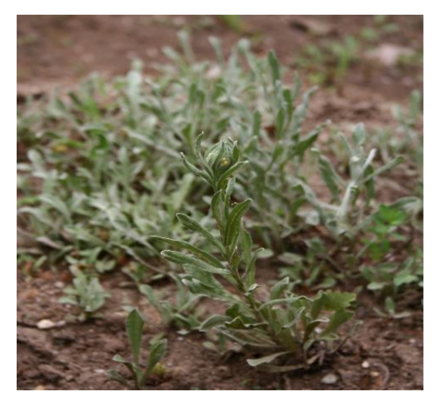
Figure 1. Helichrysum arenarium plants in the early stage of blooming (July 2013) at the "Dimitrie Brândză" Botanical Garden of the University of Bucharest, Romania (used with permission from Ref. [24]).

Biological peculiarities. Helichrysum arenarium (L.) Moench is a plant that belongs to the Helichrysum section and normally grows up to 20 cm high but can reach heights of 10 to 30/50 cm [10,23]. It has lanceolate leaves that are whitish-green due to the numerous white hairs that cover them, giving a felt-like appearance [23]. Figure 1 shows H. arenarium plants that were cultivated in Romania at the "Dimitrie Brândză" Botanical Garden of the University of Bucharest in 2013 [24]. The appearance of the habitus of the plants can be observed, with young shoots on which the lanceolate leaves are inserted and apically the inflorescence in the early stages of flowering.