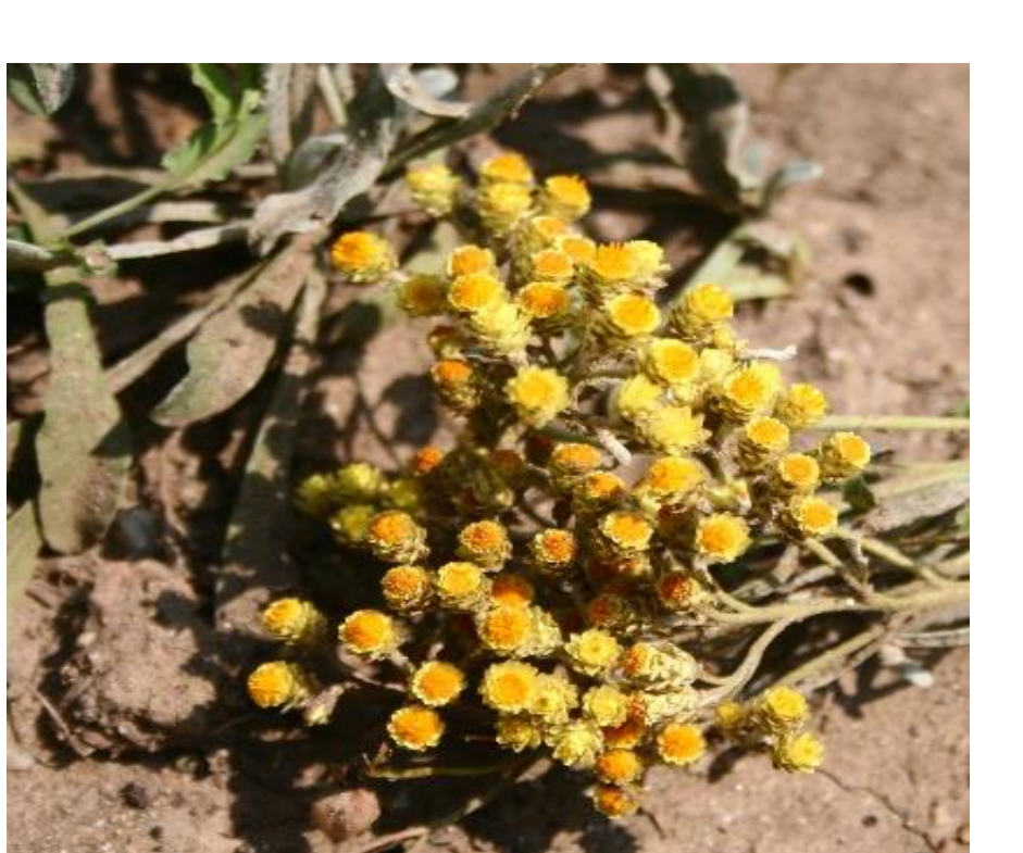
Figure 2. Helichrysum arenarium plants in the stage of full flowering inflorescence (August 2013) at the "Dimitrie Brândză" Botanical Garden of the University of Bucharest, Romania (used with permission from Ref. [24]).