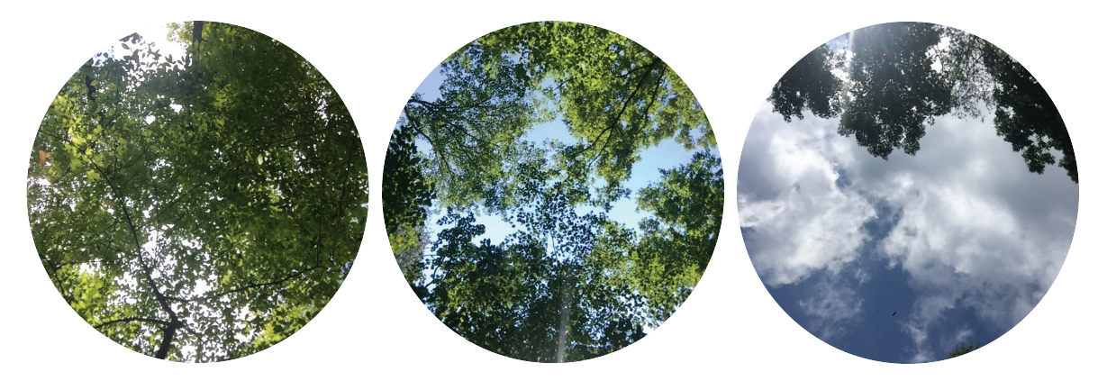
Figure 3. Hemispherical photographs taken from the center of unthinned ( left ), moderately thinned ( center ), and heavily thinned ( right ) main plots utilized in our study site in the Bridgestone–Firestone Centennial Wilderness, TN, USA during the peak flowering season of Platanthera integrilabia .