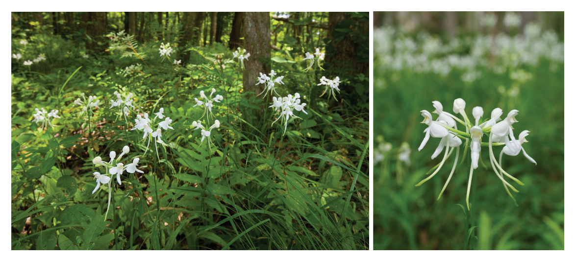
Figure 1. Occurrence of the terrestrial orchid Platanthera integrilabia in an acidic swamp in Tennessee, USA ( left ) and an inflorescence of the white fringeless flowers that distinguish this species from others in the genus ( right ).

The genus Platanthera (Richard), commonly known as bog orchids, fringed orchids, or rein orchids, contains approximately 200 species worldwide and 32 species in North America and is primarily north temperate with a few species native to tropical habitats [41]. This group of orchids is terrestrial, perennial, erect to somewhat decumbent, and often succulent and identified by broad anthers. Flowers of species in this genus range in color from orange, purple, green, yellow, or white with a fringed or entire labellum. Platanthera integrilabia is a perennial herb, which grows from a single tuber and typically emerges as a single-leaved juvenile with resulting two to three basal leaves upon flowering [30]. This species is characterized by generally low rates of flowering, but in the flowering stage, can produce a stem up to 60 cm with inflorescences of 6–20 showy white flowers clustered in loose racemes [28,30]. As suggested by its common name, the flower of P. integrilabia lacks fringe along the labellum and has a noticeable elongated spur extending from the back (Figure 1).