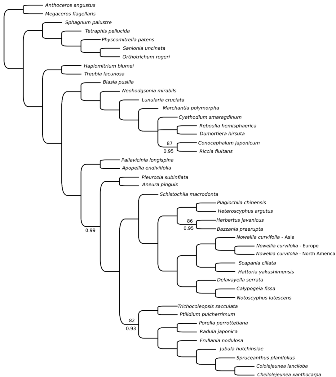
Figure 4. Phylogenetics relationships of 44 bryophyte species based on protein-coding sequences obtained using ML analysis. Bootstrap values lower than 100 are given at the nodes. Bayesian inference resulted in a tree with congruent topology and PP values lower than 1 are given below branches.