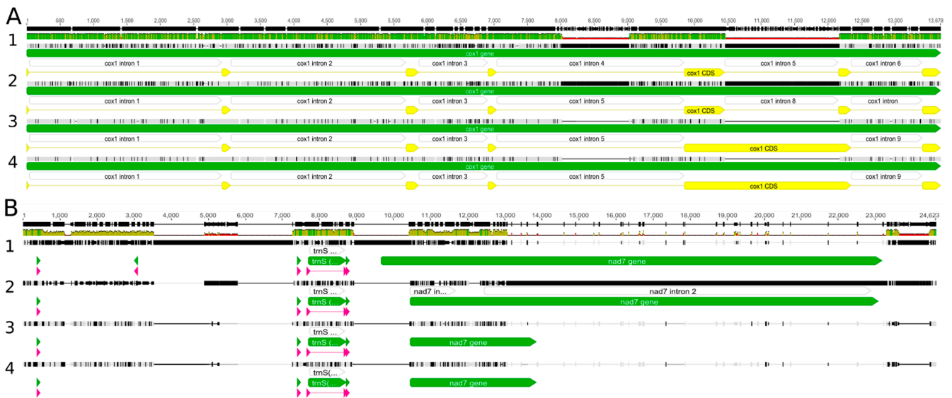
Figure 3. The main sources of mitogenome length variation among Nowellia and its close relatives: 1— Calypogeia integristipula , 2— Nowellia curvifolia , 3— Scapania ornithopodioides , 4— Scapania ampliata . (A)—intron reductions in cox1 gene; (B)—deletion in region between nad3 and rpl10 .