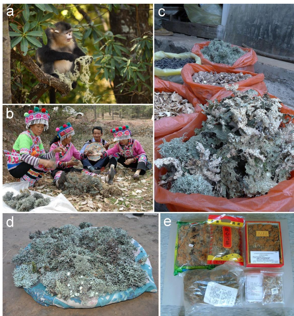
Figure 1. Lichens are used by animals and humans. (a) Rhinopithecus roxellana eating Usnea in south-western China. (b) Bai minority people harvesting lichens in Yunnan. (c) Ethnic lichen market in Yunnan. (d) Freshly gathered lichens for the kitchen in Nepal. (e) Health-promoting tea products of Lethariella and Thamnolia . (a–c,e) photographed by Li-Song Wang; (d) photographed by Shiva Devkota.

Wila ( Bryoria fremontii (Tuck.) Brodo & D. Hawksw.) was an important food in parts of North America, where it was usually pit cooked. Northern peoples in North America and Siberia traditionally eat the partially digested reindeer lichen ( Cladonia P. Browne) after they remove it from the rumen of caribou or reindeer that have been killed. Rock tripe ( Umbilicaria Hoffm. and Lasallia Mérat) is a lichen (sometimes more species of lichens) that has frequently been used as an emergency food in North America and one species, Umbilicaria esculenta (Miyoshi) Minks, is used in a variety of traditional Korean and Japanese foods [12].