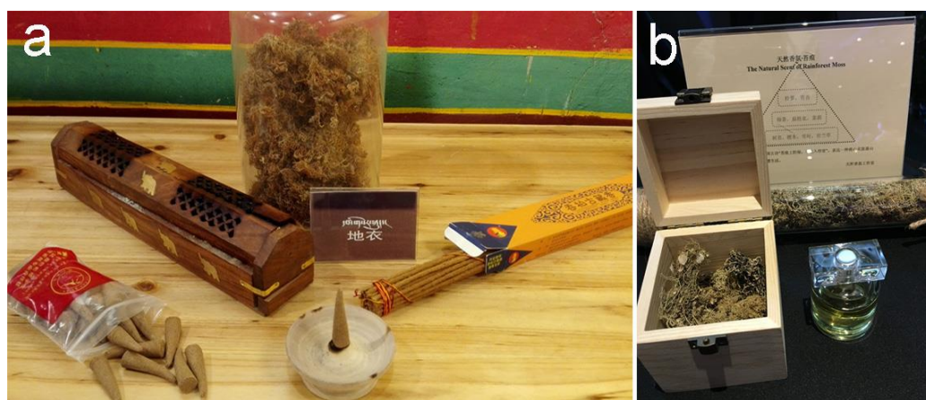
Figure 5. (a) Lethariella , used for Tibetan incense. (b) Usnea and Sulcaria , used for raw materials of perfume in Yunnan.