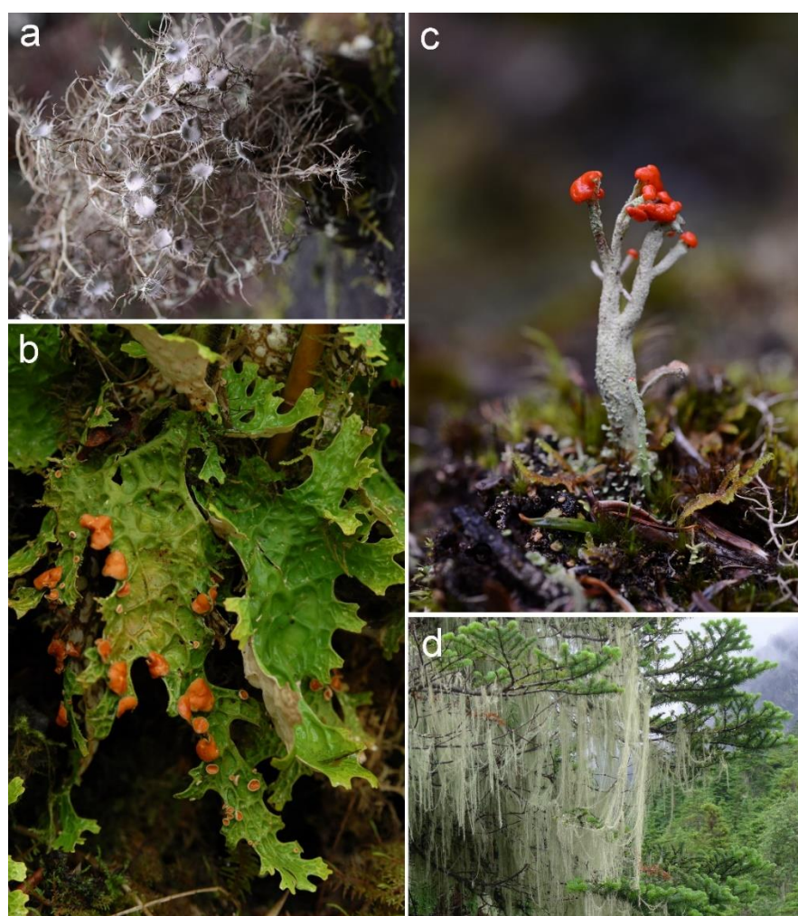
Figure 2. Selected traditional medicinal lichens. (a) Sulcaria sulcata (Lév.) Bystrek. (b) Cladonia sp. (c) Lobaria sp. (d) Usnea longissima .

species is significantly higher than in other fungi and edible algae and Lobaria species are rich in calcium [30]. Similarly, Peltigera leucophlebia (Nyl.) Gyeln. is used as a supposed cure for thrush (Aphtha, Candidiasis), due to the resemblance of its cephalodia to the appearance of the disease [31]. The earliest report about traditional medicine of lichen could be the Usnea longissima Ach. in the Chinese Qing dynasty (ca. 1500); it was reported that the Usnea species were used as litmus, to treat cold, swelling and pain [32]. Lichens also have their place in current pharmaceutical research; lichens produce metabolites of potential therapeutic or diagnostic value [18]. Some metabolites produced by lichens are structurally and functionally similar to broad-spectrum antibiotics, while a few of them are associated, respectively, with antiseptic similarities [33]. Usnic acid is the most commonly studied metabolite produced by lichens [15]. It is also under research as a bactericidal agent against Escherichia coli (Migula) Castellani & Chalmers and Staphylococcus aureus Bergey.