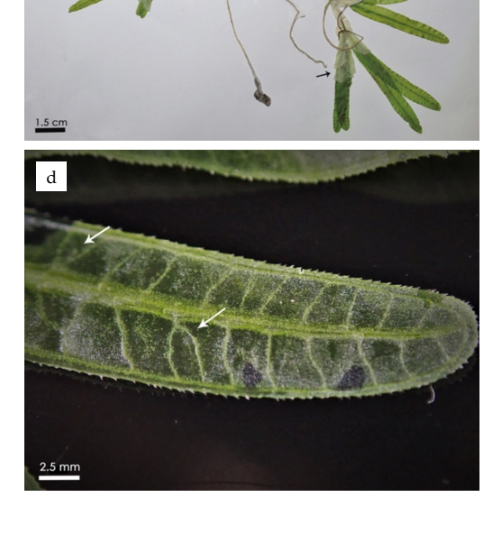
Figure 1. Cont.