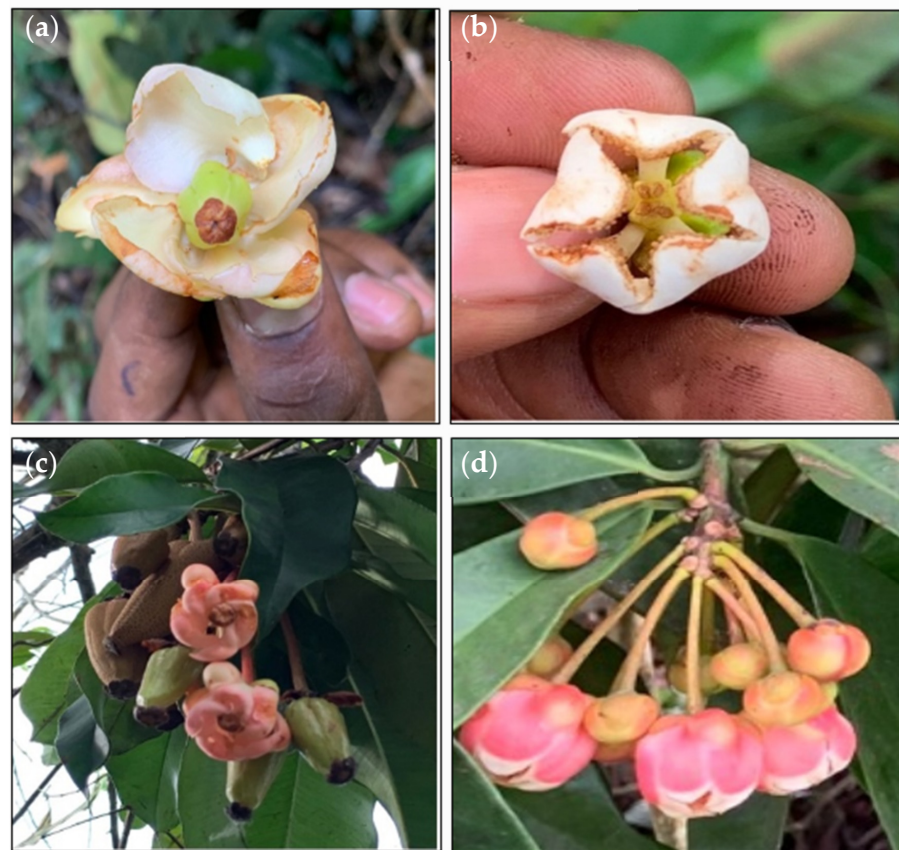
Figure 3. A. parviflora flowers showing different colors and sexes. (a) White/cream female flower with a developing fruit, (b) white/cream male flower, (c) pink/red female flower, (d) pink/red male flower.