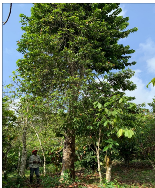
Figure 2. A typical A. parviflora A. Chev. tree growing in the wet evergreen forest zone of Ghana (source: author’s archive).