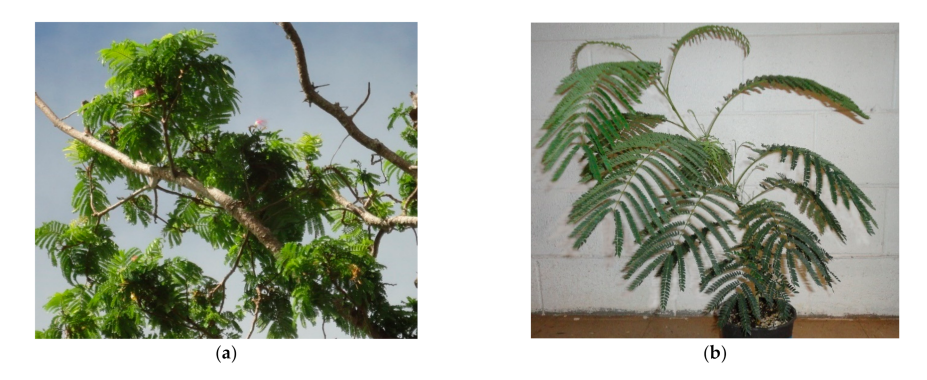
Figure 1. Vegetative organs of Serianthes nelsonii exhibit rapid growth rates. ( a ) One month after complete defoliation during a 15 May 2015 tropical cyclone, the emergent canopy of a mature tree exhibited fully expanded healthy leaves and flowers; ( b ) A five-month-old nursery plant exhibited rapid stem growth and robust leaves due to shade and under-watering in the nursery. The rapid stem growth produced weak stems that were unable to maintain orthotropic orientation, inducing lateral bud growth that reduced plant quality.

A full understanding of leaf traits for tree species that are native to the Mariana Islands includes where they fit in the leaf economics spectrum [29] and the approach for how each species responds to the threats imposed by tropical cyclones [30]. One end of the spectrum is characterized by tree species that produce expensive leaves that maintain mechanical integrity with long lifespan, and these species resist tropical cyclone damage by constructing strong stems that can withstand the wind forces despite extensive wind drag of the canopy. The opposing end of the spectrum is characterized by tree species that produce inexpensive leaves that are dislodged from the stems during a tropical cyclone, and this saves the trees from structural damage because the wind drag is minimized by the absence of leaves. An example of this is S. nelsonii . For S. nelsonii and other species with inexpensive leaves, the re-construction of new leaves following a defoliating tropical cyclone is rapid (Figure 1a).