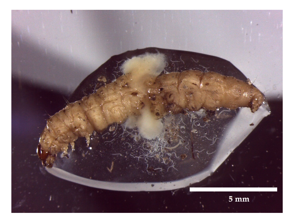
Figure 2. Steinernema carpocaspsae (Weiser) and Steinernema feltiae (Filipjev) nematodes released from codling moth larvae, Cydia pomonella (L.), within laboratory experiments.

rates, 62% and 100% mortality occurred in treated larvae, respectively. There is evidence to show that S. carpocaspsae and S. feltiae can be applied to reduce the survival of codling moth larvae as a foliar application [172] and woolly apple aphid as a spot treatment [173] in the field. However, foliar application of nematodes requires high moisture levels to ensure that nematodes do not desiccate and are able to reach the target host. Although there are several publications showing the efficacy of nematodes for pest control, they are rarely employed in orchards [162]. This may be because control is often difficult to quantify in a field setting or incorrect application timing or unfavourable conditions result in reduced efficacy.