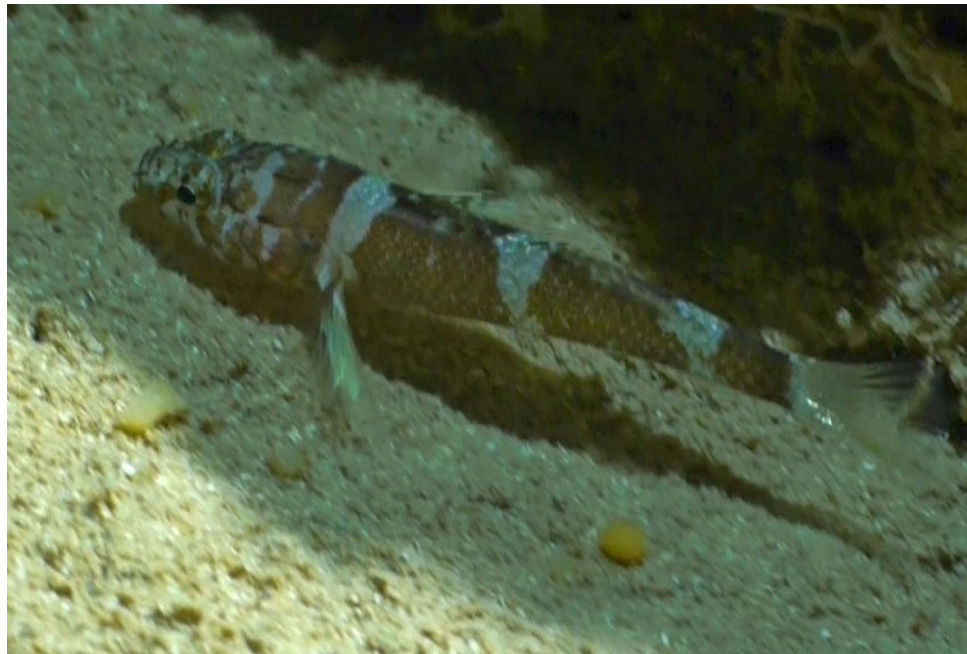
Figure 3. Didogobius splechnai photographed in Nereid cave, N. Crete.

Didogobius splechnai is assigned to the “Least Concern” category in the IUCN Red List of Threatened Species, with an unknown population trend [31], and its distribution extends from the Balearic Islands to the Aegean Sea [10,22,27,32–39]. This species is known to live in caves from 4 to 55 m [22,32], either on sandy bottoms or on little shelves and cave walls, but nearly always close to holes or crevices [6,32,38].