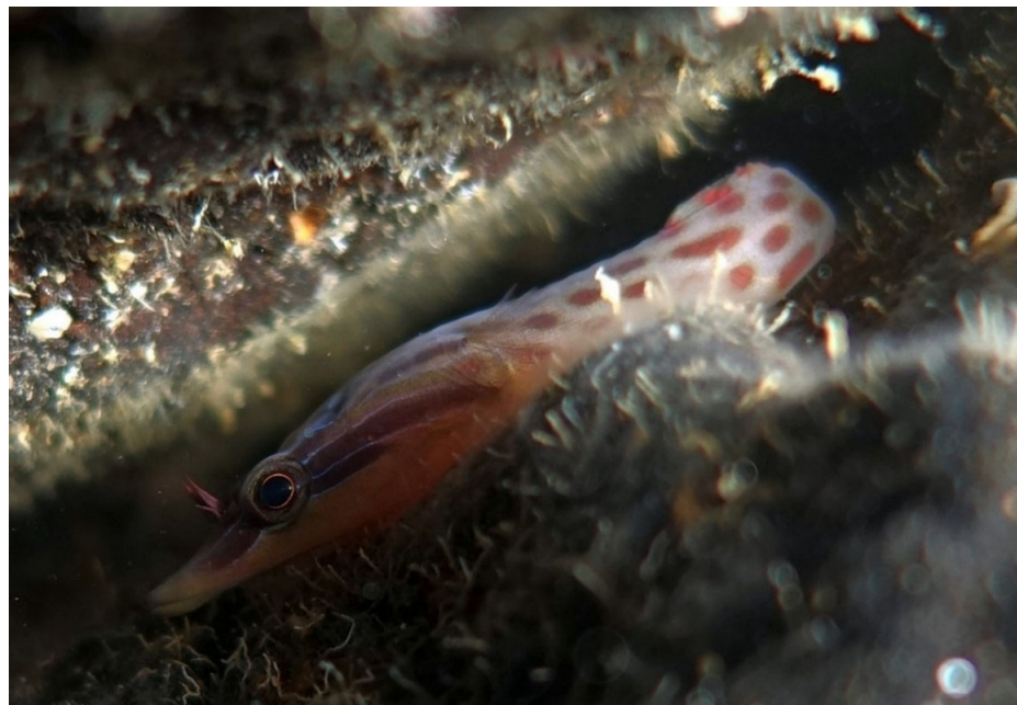
Figure 9. Lepadogaster cf. lepadogaster photographed in a shallow dark cave on Kalymnos Island.

According to Wagner et al. [71], all representatives of the genus Lepadogaster inhabit shadowy environments like crevices, seagrass rhizomes, pebble interstices, and underneath boulders. The shore clingfish L. lepadogaster constitutes an inconspicuous species, which for many years was described as the subspecies L. lepadogaster lepadogaster , closely related to L. lepadogaster purpurea (Briggs, 1955). Henriques et al. [72] proposed that the two subspecies are actually distinct species based on their morphological differences. A few years later, Almada et al. [73] documented their molecular dissimilarities. The L. lepadogaster distribution range spans from the European and northwestern African and Atlantic coasts to the Mediterranean and Black seas [71]. The presence of the species was recently recorded in Greek waters from two locations in Crete and two more in Attica [71]. It has been assigned as "Least Concern" in the IUCN Red List of Threatened Species, with an unknown population trend [74]. In the present study, an additional record of this species is reported from Kalymnos Island. While L. lepadogaster was previously recorded from marine caves of Crimea [75] and the Mediterranean coast of Israel [76], only L. candolii was recorded in a single marine cave of the Aegean Sea, associated with the sponge Aplysina aerophoba (Nardo, 1833) [4,24]. Thus, this study constitutes the second record of a clingfish species in a marine cave of the Aegean Sea.