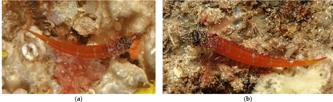
Figure 7. Triptyerygion melanurum photographed in Seal’s cave, Samos Island (a) and Agios Efstathios cave, Milos Island (b).

Triptyerygion melanurum is a three-fin blenny endemic to the Mediterranean Sea, classified as a “Least Concern” species in the IUCN Red List, with a presumably stable population trend [58]. It has been reported throughout the Aegean Sea [47,59] as well as from caves in Croatia [53], Italy [60], Lebanon [61], and Turkey [25]. Triptyerygion melanurum rarely exceeds 6 cm in length with adults mostly found in low-light areas, usually on walls and ceilings [59]. They are suction feeders, preying on small invertebrates including amphipods, harpacticoids, caprellids, and tanaidaceans [62].