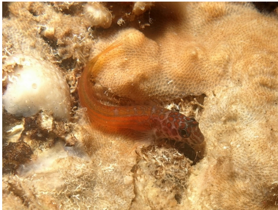
Figure 6. Microlipophrys nigriceps from the semi-dark zone in Seal's Cave of Rhodes Island.

The black-headed blenny M. nigriceps is a scarcely recorded sciaphilic species, endemic to the Mediterranean Sea [5]. It is known to inhabit dimly lit biotopes such as crevices, caves, caverns, and underneath pebbles. More specifically, M. nigriceps has been reported in the Balearic Islands, Spain [10], France [52], Italy [11,12], Croatia [45,53], Montenegro [54], Greece [47], and Turkey [46,55]. Although it appears in shallow waters, there is a dearth of knowledge regarding M. nigriceps and its population trends due to its small body size and cryptic behavior. M. nigriceps is assessed as "Least Concern" in the IUCN Red List of Threatened Species [56]. Through the present study we report the second record of this species from a marine cave of the Eastern Mediterranean Sea [4], following a recent study from Turkey ([55] as Lipophrys nigriceps ).