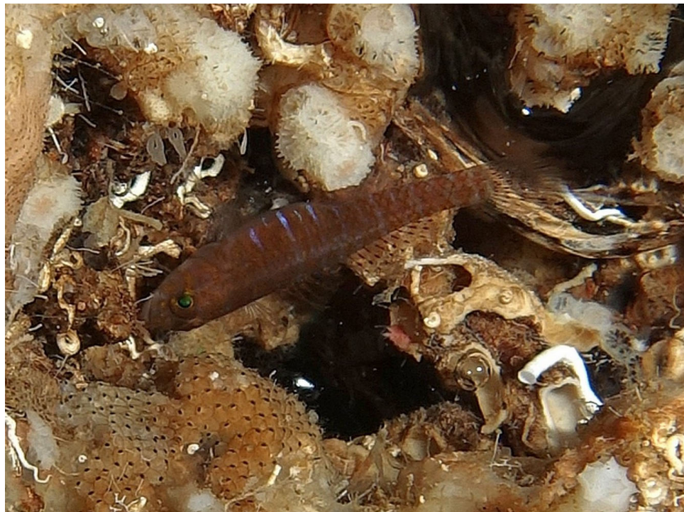
Figure 2. Corcyrogobius liechtensteini photographed in Pantieronissi cave, Cyclades.

Liechtenstein's goby is a rare cryptobenthic gobiid reported in approximately 20 published records, spanning from the Balearic Islands to the Aegean Sea [12,13,20,22–27]. Its known distribution range, though, is fragmented due to its exclusively cryptic habit [5,28]. The species has been assessed as of “Least Concern” in the IUCN Red List of Threatened Species, with an unknown population trend [28]. In the Aegean Sea, this species has been reported from its southmost border, the island of Crete [23] and its northmost area, Chalkidiki Peninsula [29], as well as from Lesvos Island [13,24] in Greece and Siğack Bay in Turkey [26]. The present report is the fifth record of Liechtenstein's goby in the eastern Mediterranean Sea. Even though C. liechtensteini can be found in other cryptic habitats [5], in caves it is mostly seen on the walls and ceiling, within crevasses or biogenic structures like rhodophyte thickets, branching bryozoans, sponge canals, and holes of the boring bivalve Lithophaga lithophaga (Linnaeus, 1758) [10,13,24]. This is the fourth published record of C. liechtensteini from Greece.