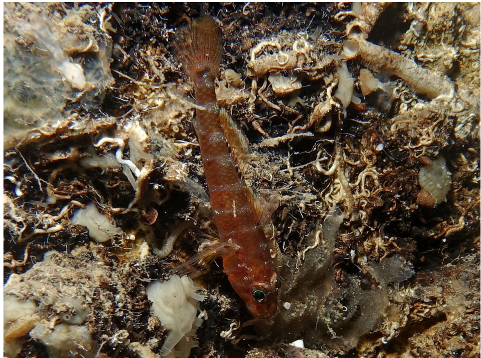
Figure 4. Gammogobius steinitzi photographed in Neptune's cave, Karpathos Island.

Steinitz's goby has been assigned to the "Least Concern" category in the IUCN Red List of Threatened Species, with an unknown population trend [40]. It has been reported along the north Mediterranean coastline from Spain to Turkey [6,15,23,30,33,41–45] and has even been found in the Black Sea [14]. It is a cryptic goby that is known exclusively from the marine caves of the Mediterranean and the Black Sea. Similar to our observations, most published records reported G. steinitzi on cave walls and ceilings, close to small holes and crevasses. This is the second published record of G. steinitzi from Greek waters.