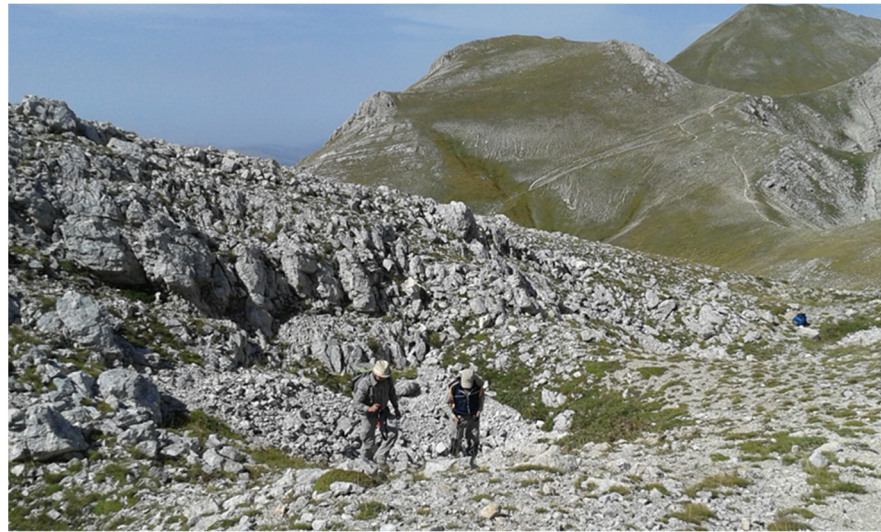
Figure 3. The typical habitat of the G. argenteum in the study area.