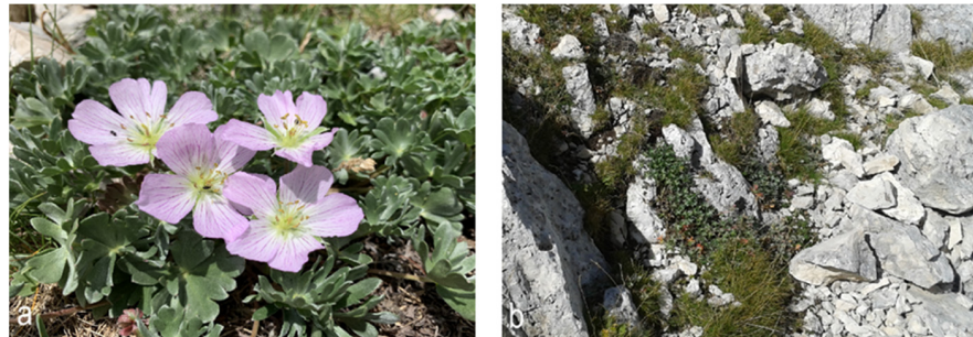
Figure 4. G. argenteum close-up of flowering (a) and G. argenteum community in the study area on the fractured rocky ridges (b).

The elaboration of the phytosociological relevés and the comparison with the plant communities occurring in the alpine and subalpine belts of the Central Apennines, which exhibit floristic similarities with the G. argenteum community in the study area (Table S1), highlight the floristic–vegetational autonomy of the G. argenteum community under investigation, for which the new Festuco italicae – Geranietum argentei association is proposed (Table 1).