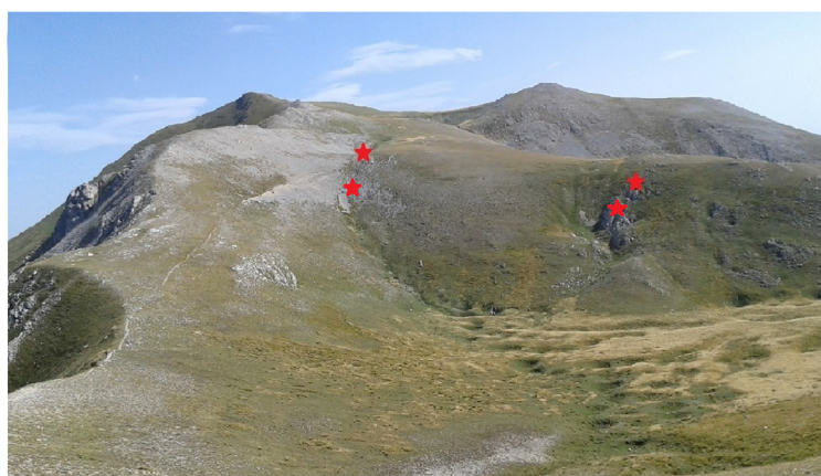
Figure 2. Plant landscape of the study area (the red stars indicate the locations of the relevés).

The study area is located on Mount Argentella in the Sibillini Mountain range and lies within the Natura 2000 Special Areas of Conservation (SAC IT5210071 “Monti Sibillini (versante umbro)”), included in the Monti Sibillini National Park. The substrate is exclusively calcareous, belonging to the Umbrian–Marche limestone succession and specifically to the Massive Limestone Formation [24]. The morphology is very rugged, with rocky bumps and ridges, scree, sinkhole systems, rocky detrital valleys, and snow beds (Figure 2).