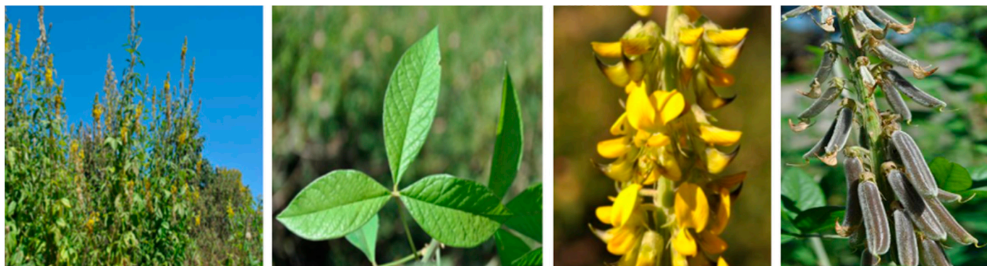
Figure 1. Crotalaria cleomifolia . From left to right—aerial part, leaves, flowers, and pods.

the traditional beverage preparations. Based on the well-established literature, we focused our attention on the potential presence of toxic pyrrolizidine-derived alkaloids that may seriously compromise the traditional use of the seeds of C. cleomifolia . Herewith, we report the extraction, purification, and structural identification of alkaloids from the seeds of C. cleomifolia .