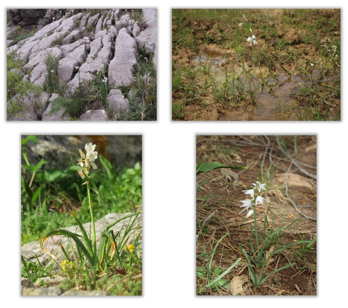
Figure 1. Photographs of the plant species. Western population: ALP ( upper left ) and VIL ( bottom left ). Eastern population: LV2 ( upper right ) and LV3 ( bottom right ). See Table 1 for acronyms and information on each location.

there are two populations: a western one (provinces of Cádiz and Málaga) and an eastern disjunction (province of Jaén) [5]. It develops on calcareous rocks [6] sheltering in shady and humid crevices [7]. However, in the eastern population, it grows on relatively humid clay soils, among limestone rocks, with little or no inclination, as seems to be the case in the localities of Morocco. Photographs of the plant species of the two populations are shown in Figure 1.