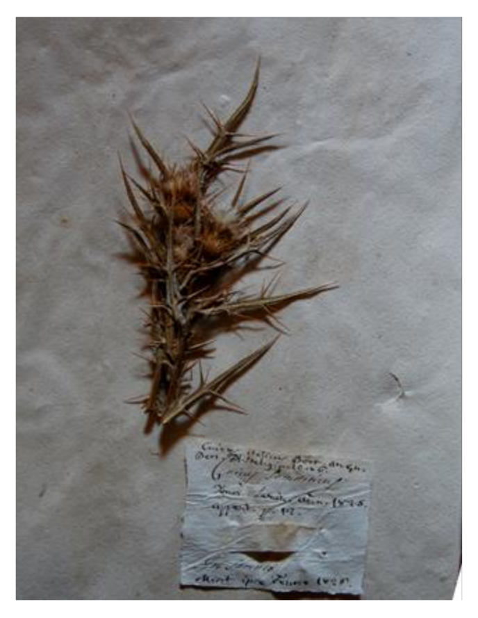
Figure 2. Neotype of Cn. samniticus Ten. (BOLO), by permission of the Curator.

= Cnicus samniticus Ten.—Neotype (designated here): "In Samnio", s.d. [1825?], s.c., s.n. (BOLO [digital image!]).—Figure 2.