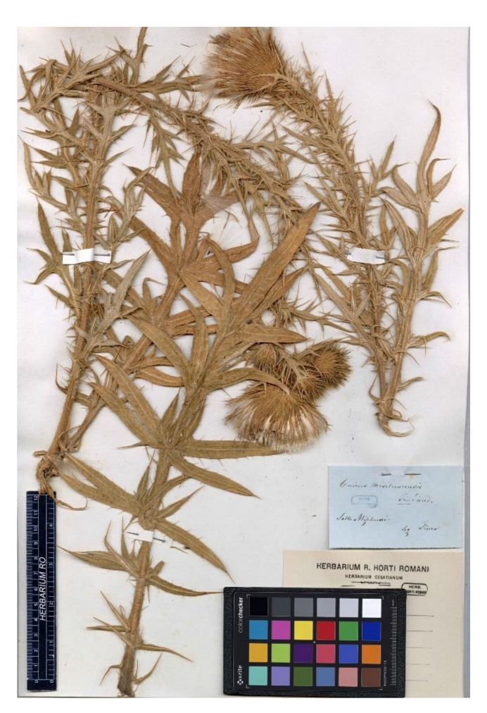
Figure 6. Lectotype of Ci. misilmerense Ces., Pass. & Gibelli (RO), by permission of the Curator.