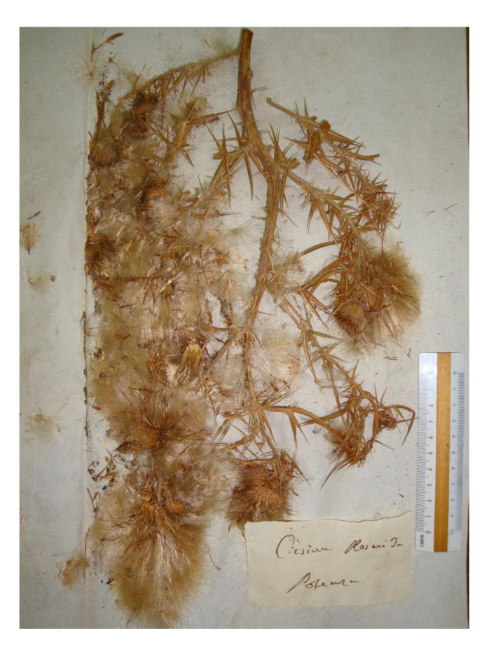
Figure 5. Neotype of Cn. rosani Ten. (NAP), by permission of the Director.

403. 1882 \equiv Ci. lanceolatum subsp. rosani (Ten.) Arcang., Comp. Fl. Ital., ed. 2: 723. 1894.—Neotype (designated by Lacaita [46] (p. 125)): Italy, Basilicata, Potenza, s.d., F. Rosano? s.n. (NAP, collection Tenore!).—Figure 5.