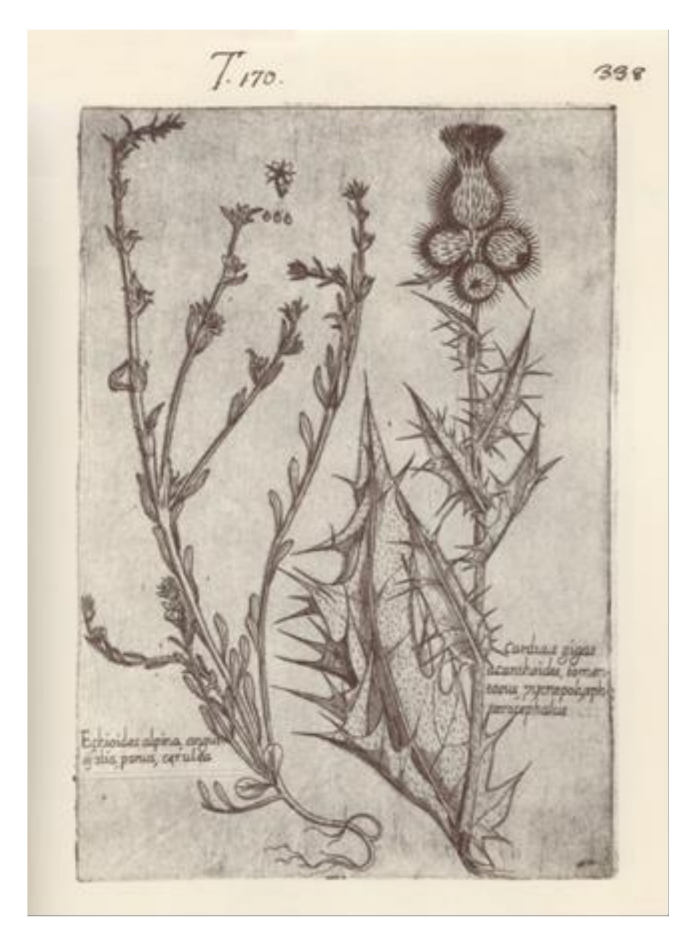
Figure 3. Lectotype of Ca. gigas Ucria (from the Panphyton siculum, plate 170, figure on the right side).

Notes on Ca. scaber—Poiret [56] validly published this name by a Latin diagnosis ("Foliis amplexicaulibus lanceolatis dentato-spinosis supra scabris et viridibus; subtus tomentoso-albis, calyce inermi"; transl.: "[A Carduus] with leaves embracing, lanceolate, with spiny teeth, bristly and green above, lanate an whitish below, with unarmed involucres"), a description in French, and a taxonomic note. In particular, he hypothesized that the same plant could have been indicated by Tournefort by the polynomial "Cirsium orientale, cardui lanceolati folio flore purpurascente". Finally, he indicated as habitat the stony and dry hills inhabited by the tribe of Nadis, probably corresponding to the area between North Tunisia and Algeria.