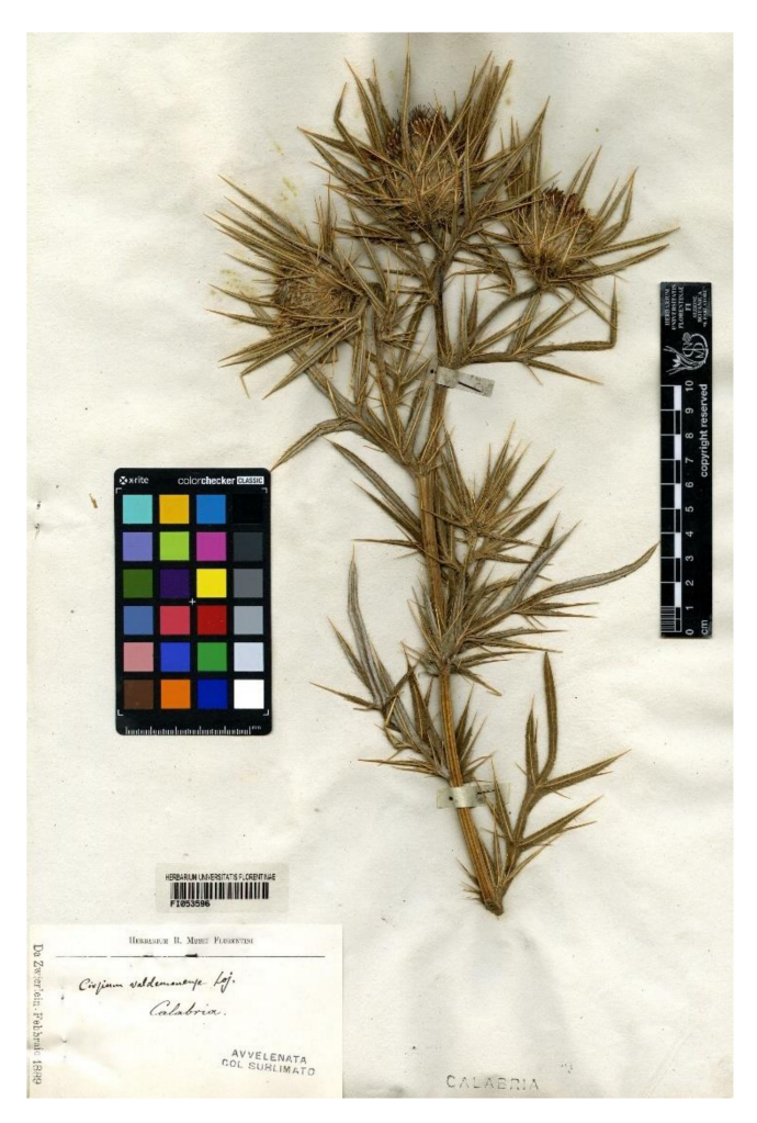
Figure 4. Lectotype of Ci. eriophorum var. vallis-demonii fo. calabrum Fiori (FI., barcode FI053596), by permission of the Curator.