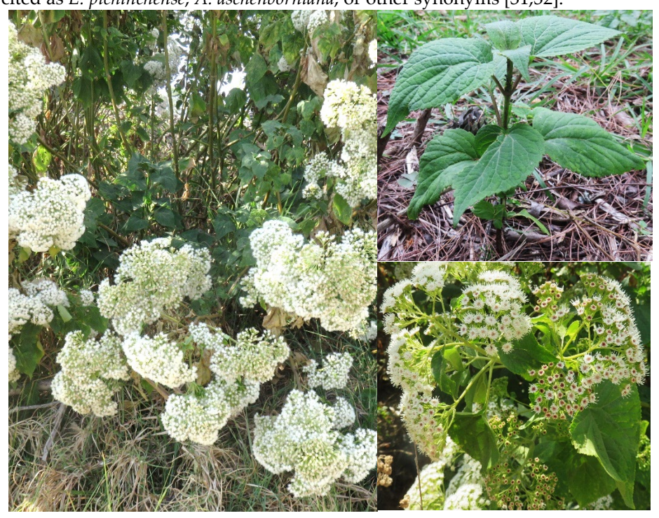
Figure 1. Typical wild plants of A. pichinchensis growing in the municipality of Tepoztlán in the state of Morelos, Mexico.

Here, we must clarify that due to the issues with nomenclature described above, throughout the document, we will refer to studies on A. pichinchensis , including references cited as E. pichinchense , A. aschenborniana , or other synonyms [31,32].