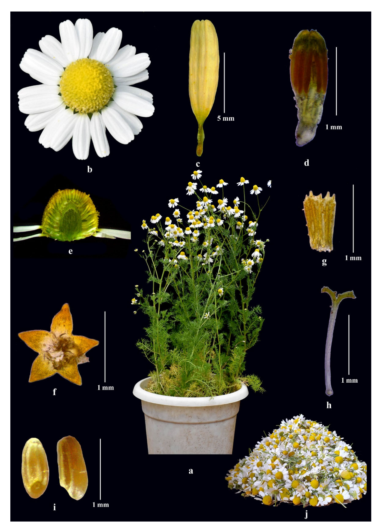
Figure 2. Different plant parts and habit of German chamomile: flowering plant ( a ); flower head ( b ); ray floret ( c ); disk floret ( d ); capitulum I ( e ); teeth/petals of disc floret ( f ); anthers ( g ); stigma ( h ); seed ( i ); fresh flower harvest ( j ).