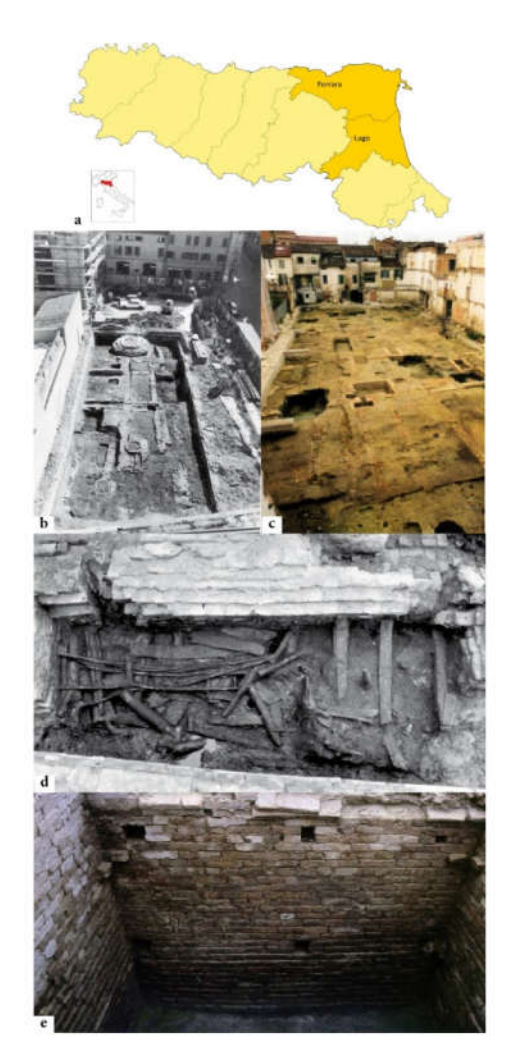
Figure 1. The two archaeological sites examined: Ferrara (context I—no. 16c) and Lugo (context II—no. 15); geographic location ( a ), overview of archaeological excavation ( b , c ) and pits ( d , e ).

In this study, the seeds were investigated by morphometric and genetic analyses. Furthermore, a historical and ethnobotanical interpretation of the taxa was performed using written sources and the exsiccata present in the oldest Italian herbaria.