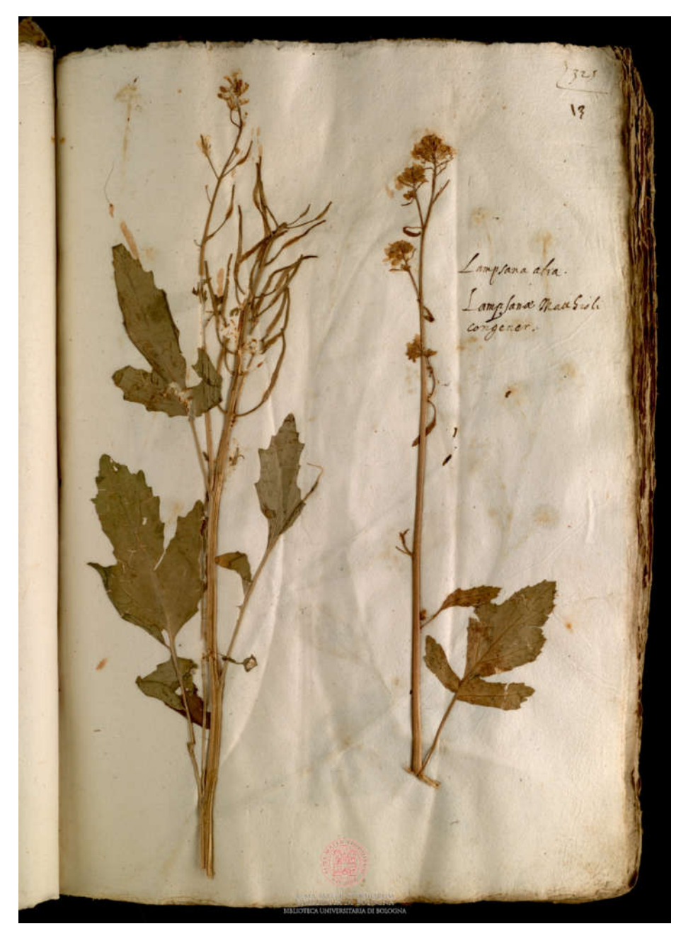
Figure 4. Specimen of Sinapis alba L. preserved in Erbario Aldrovandi, vol. IV, c. 13r.; on the sheet, "Lampsana alia, Lampsanæ Matthioli congener" is written.