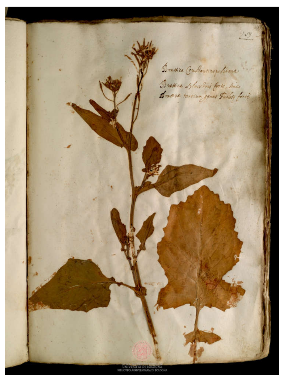
Figure 3. Specimen of Brassica rapa L. preserved in Erbario Aldrovandi, vol. V, c. 83r.; on the sheet, "Brassica Constantinopolitana, Brassica syluestris forte, siue Brassica tertium genus Fuchsij forte" is written.