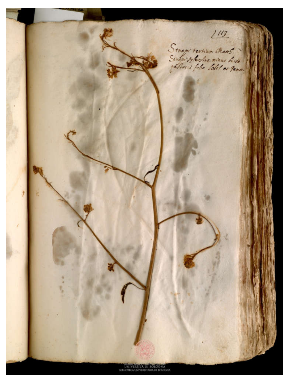
Figure 2. Specimen of Brassica nigra W.D.J. Koch preserved in Erbario Aldrovandi, vol. II, c. 113r.; on the sheet, "Sinapi tertium Matth., Sinapi syluestre minus bursæ pastoris folio Lobel. et Penæ" is written.