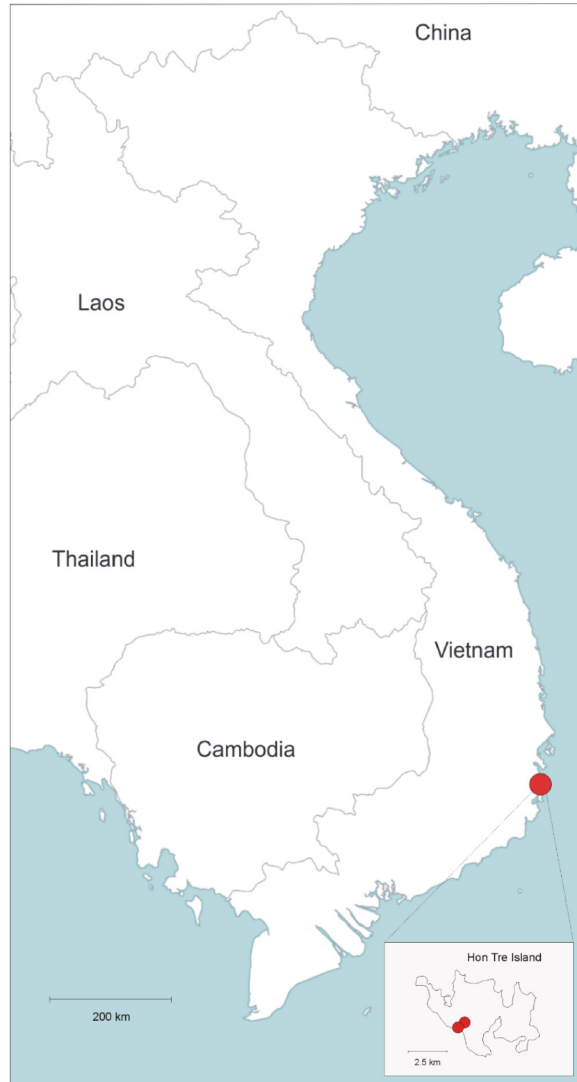
Figure 2. Known distribution of Capparis oxycarpa (red circles).

Distribution and habitat: The new species is only known from Hon Tre Island (Figure 2), where it has been observed in two close locations, in xerophytic scrub on sea faced dry slopes and in secondary lowland forest, up to 100 m elevation.