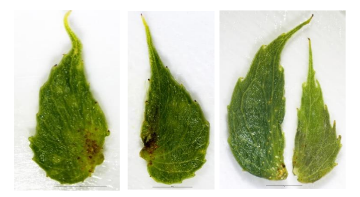
Figure 6. Stipules of S. babylonica var. matsudana 'Umbraculifera' ( left , center ) and S. babylonica 'Babylon' ( right ).

The color of thin branches and branchlets of 'Umbraculifera' ranges from yellowgreenish to purple-brownish (the upper side of the branches exposed to the sun gets tanned, gaining purple color). Mature branches and leaves are glabrous. Buds blunt at the apex ( S. fragilis 'Bullata' has acuminate buds). Outermost cataphylls inside the buds densely pubescent as in S. babylonica var. matsudana (glabrous S. fragilis 'Bullata') (Figure 5). Young leaves are reddish; unfolding leaves are densely pubescent on the upper side, rarely on the lower side and mainly along the central vein. Stipules are large, with rolled up edges and sparse hairs. Stipule attachment point, as in S. fragilis 'Bullata', is on the side of the lower third part of the stipule (in S. babylonica var. babylon —at the base) (Figure 6). Bracts glabrous is acuminate. Ovaries sessile with a very short stipe. Nectary occurred as one or rarely two.