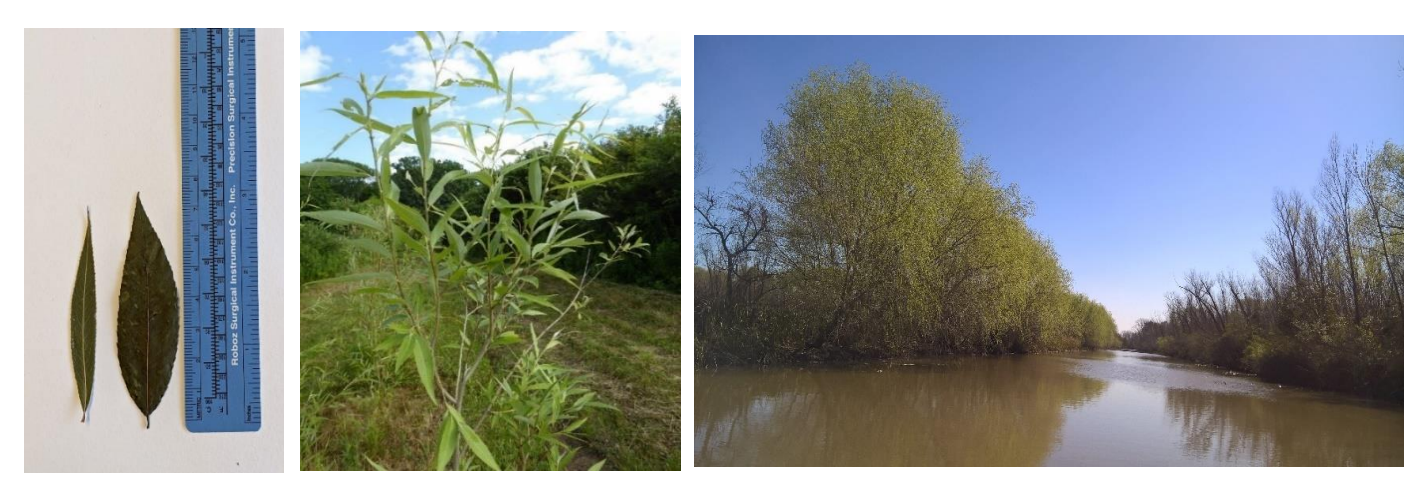
Figure 1. (Left) Narrow-lanceolate leaves of S. babylonica 'Babylon' (left) and lanceolate leaves of S. babylonica var. sacramenta (right). (Center) The green-gray bark of S. babylonica var. sacramenta retains its color even on the side exposed to the sun. Right: S. babylonica var. sacramenta in the Paraná Delta region, Argentina.