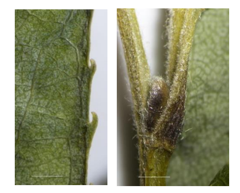
Figure 2. Salix babylonica var. sacramenta. Leaf margin (left). Branchlet with the bud (right).

There were some similarities between Specimen 1 and Specimens 2–6, which had a greater number of valves with 1 ovule compared to other specimens. While the origin of Specimen 2, representing a cultivated plant, was unknown, Specimens 3–5 were collected by Skvortsov in Yunnan province in southern China, suggesting that it was possible that S. babylonica var. sacramenta also originated from the south of China. Notably, Skvortsov placed Specimens 3–5 into a folder called S. babylonica , though the individual specimens were identified only as " Salix ". These specimens had the unusually thin and short annual branchlets, and it was possible that Skvortsov was uncertain about their identity. A similar branching pattern was observed in S. babylonica var. sacramenta , which resulted from the growth of a few cycles of branchlets during a growing season. At the end of each cycle, the tip of the branchlet ceased growth and died; this event was followed by the development of the nearest to the tip axillary bud, which grew into a new shoot. The new shoot pushed the dead tip aside and continued its growth along the previous axis of the branchlet. This process continued throughout the season resulting in a few orders of branchlets forming long and thin stems.