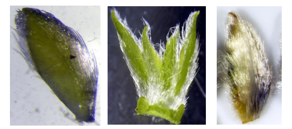
Figure 4. Outermost cataphylls of S. babylonica var. sacramenta ( left ), S. babylonica 'Babylon' ( center ) and S. babylonica L. var. matsudana 'Umbraculifera' ( right ) after the bud scales were removed. In both taxa of S. babylonica —var. sacramenta and 'Babylon'—hairs were located only above the central vein and along the edge so that the part of the cataphyll blade lying between the central vein and the edge, remained glabrous, also there were no hairs on its top. In the cataphylls of S. matsudana 'Umbraculifera', the abaxial side is densely and evenly pubescent with long hairs.

Figure 3. Herbarium specimen of S. babylonica 'Babylon' (NA0263746) of the live specimen NA44011 ( left ). The green-brown bark of branches of S. babylonica 'Babylon' NA44011 growing at Storrs, Connecticut, US, gets tanned, gaining purple color on the upper side exposed to the sun ( center ). S. babylonica 'Babylon' NA44011 growing at the National Arboretum, Washington, US, displays its strongly pendulous habit ( right ).