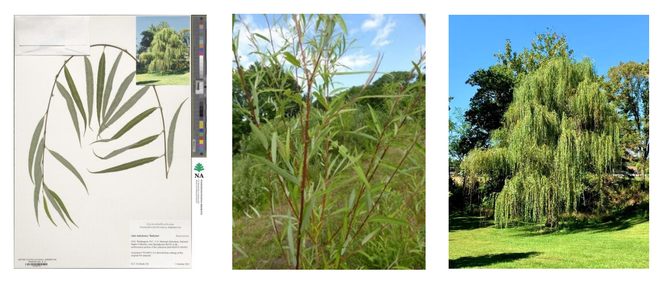
Figure 3. Herbarium specimen of S. babylonica 'Babylon' (NA0263746) of the live specimen NA44011 ( left ). The green-brown bark of branches of S. babylonica 'Babylon' NA44011 growing at Storrs, Connecticut, US, gets tanned, gaining purple color on the upper side exposed to the sun ( center ). S. babylonica 'Babylon' NA44011 growing at the National Arboretum, Washington, US, displays its strongly pendulous habit ( right ).

Salix babylonica 'Babylon' is a graceful tree with long pendulous slender branches and brown, often purple on the upper side of branchlets (Figure 3). The outermost cataphylls inside the buds are mostly glabrous with hair only above the midrib and along the margins, which is different from S. babylonica var. matsudana H.Ohashi & Yonek (Figure 4). The cultivar name 'Babylon' was proposed by Santamour McArdle [8] for the female clone, which possibly provided the basis for the original species description by Linnaeus. They described it as a highly atypical selection from the species that had been introduced along the ancient trade routes through southwest Asia, to the Near East, and to Europe around 1730.