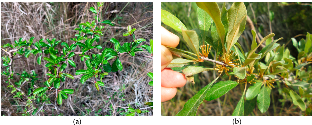
Figure 1. In situ specimens of S. reclinatum (a) superficially resembling subsp. reclinatum with glabrous surfaces from Big Cypress National Preserve, and (b) characteristic subsp. austrofloridense with rufous-tomentose abaxial surfaces, and pubescent pedicels and calyx from Everglades National Park.

Shortly thereafter, Corogin and Judd [15] published a detailed analysis of the two subspecies using micromorphological characters of abaxial leaf surfaces, which they considered to be more reliable than pubescence. This approach had previously been applied by Anderson [16] in distinguishing the rare S. thornei (Cronquist) T.D.Penn. from superficially similar congeners. Corogin and Judd’s analysis revealed that both subspecies are cryptically sympatric in BICY. Of five (5) specimens examined from the southern portion of BICY, three