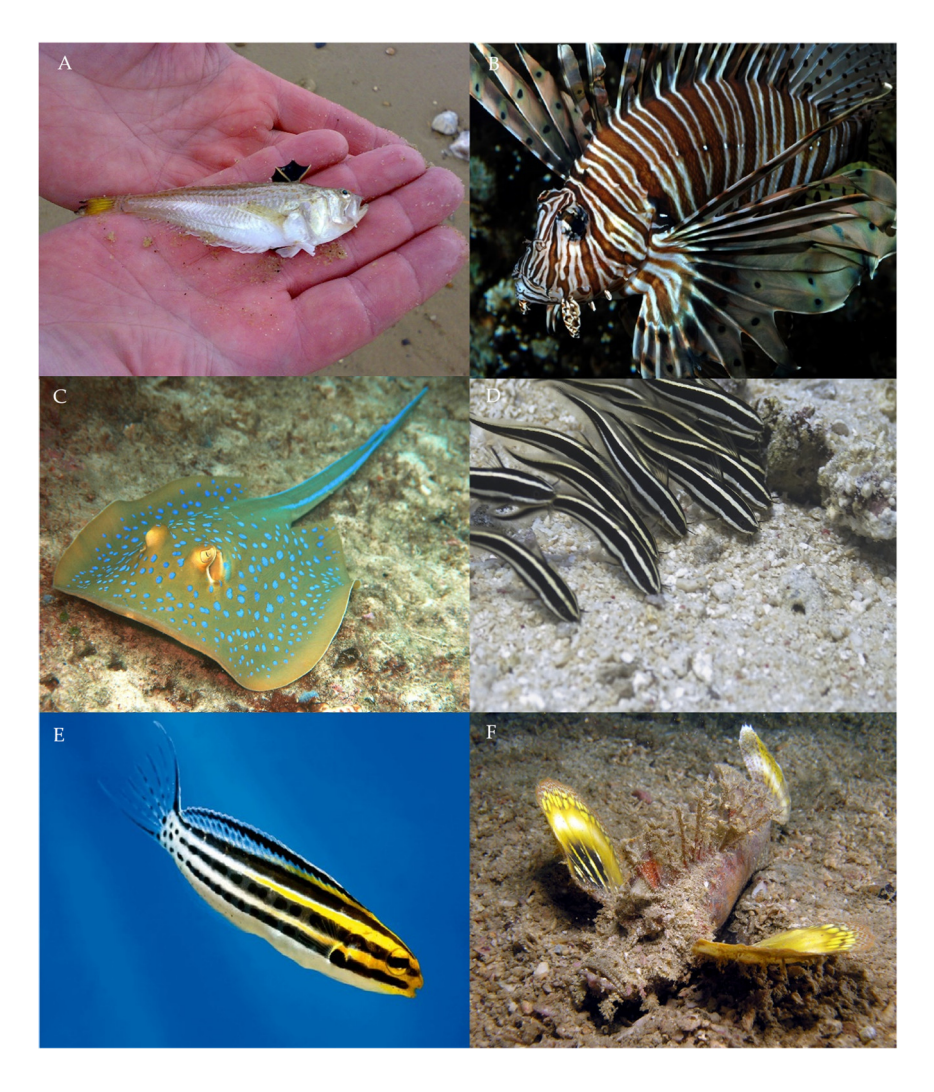
Figure 3. Examples of aposematic colouration adopted by venomous fish species: ( A ) Lesser weever fish ( Echiichthys vipera ); ( B ) Lionfish ( Pterois volitans ); ( C ) Bluespotted ribbontail ray ( Taeniura lymma ); ( D ) Striped eel catfish ( Plotosus lineatus ); ( E ) Striped fang blenny ( Meiacanthus grammistes ); and ( F ) Devil scorpionfish ( Inimicus didactylus ).

Because aposematism deters predators at the primary stages of predation, its evolution may be driven by the energetic demands of venom production and replenishment (see Section 4). Venom is energetically costly and many organisms opt to use as little as possible [34,97]. Warning colouration allows organisms to conserve venom by warning predators of their toxins. However, aposematism can evolve in species with non-venomous spines. Thus, energy costs of toxin production may not be the only driver of aposematism.