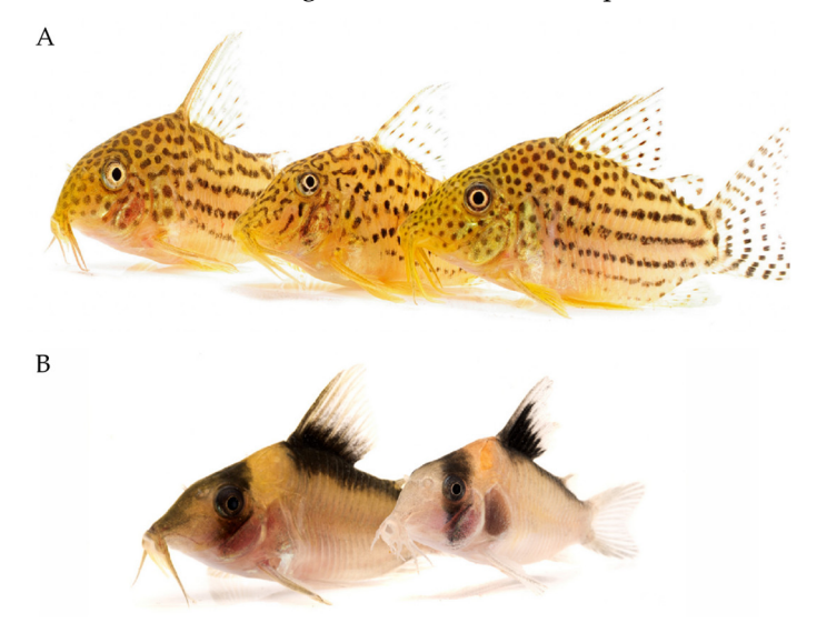
Figure 4. Examples of Müllerian mimetic patterns in venomous Corydoras catfish mimicry ring communities. ( A ) Corydoras multimaculatus, C. araguaiaensis and C. sp. (left to right) and ( B ) C. imitator (left) and C. sp. (right).

Müllerian mimicry occurs when two or more chemically defended species share similar colouration [62]. Müllerian mimics share predator education and thus can mutually coexist as a single community structure [62,109], and their aposematism can be maintained over evolutionary time through coevolution of the Müllerian mimics [112]. The abundance of multiple Müllerian mimics in a community can lead to the complex divergence of "mimicry rings" [113,114]. These structures have been observed in venomous Corydoradinae catfish [103]. Corydoras mimicry rings are unique in that species within them differ in colouration from related species in distant communities, whilst unrelated species share similar colourations [103] (Figure 4). Alexandrou et al. [103] observed 52 species that adopted 24 mimicry ring communities, with multiple unrelated species all coexisting in stable communities. This has allowed the existence of co-mimics that would be competing for trophic resources without mimicry [103]. Although their patterns are similar, they differ in other morphological features, such as snout length, which lessens competition for resources [103,112].