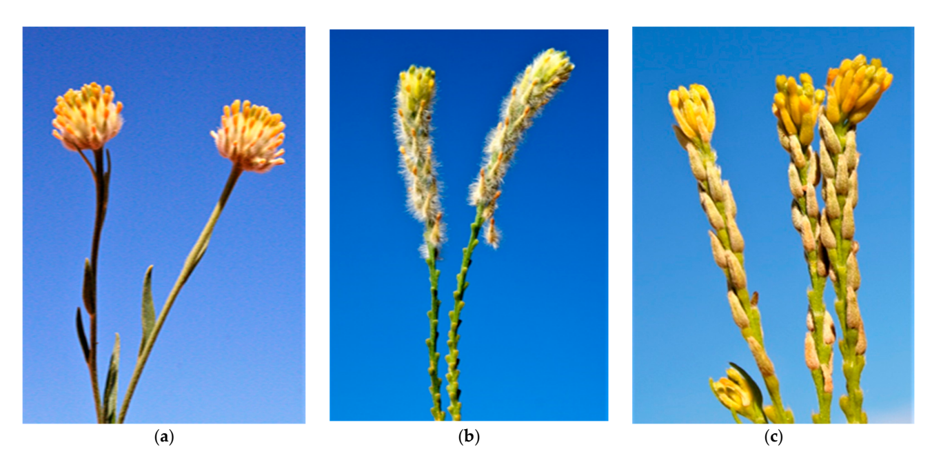
Figure 3. Flower heads of ( a ) P. simplex subsp. simplex ( b ) P. trichostachya and ( c ) P. elongata (Source: Jenny Milson with permission).

Pimelea trichostachya and P. elongata flower at any time of the year, irrespective of day length [19]; however, P. simplex flowers from late winter to late spring [2]. All four species produce many flowers. Pollination starts from the base and continues towards the tip of the flower head (Figure 3a–c). After fertilization has occurred, the ovule, now forming the inner fruit wall or endocarp, turns a deep blackish purple, which is occurring inside the floral tube and forming the outer fruit layers, the exocarp and mesocarp. During embryo enlargement, the embryo sac expands within the semi hardened endocarp.