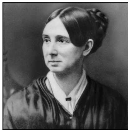
Dorothea Dix (1802-1887)

provided tours of hell on earth--vivid tableaux of cruelty and neglect. She collected immense data, not only on the individuals and conditions, but also on such details as the measurement of the rooms/cells she found and how people were dressed and what they ate. Most importantly, she described her moral affront and emotional reactions. She was able to render the unthinkable in terms that were believable.