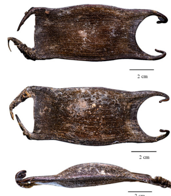
Figure 2 Egg capsule of Bathyraja brachyurops incidentally caught bottom trawl in the Rio de la Plata, Southwest Atlantic, in 2000. Dorsal (A), ventral (B) and lateral (C) view.