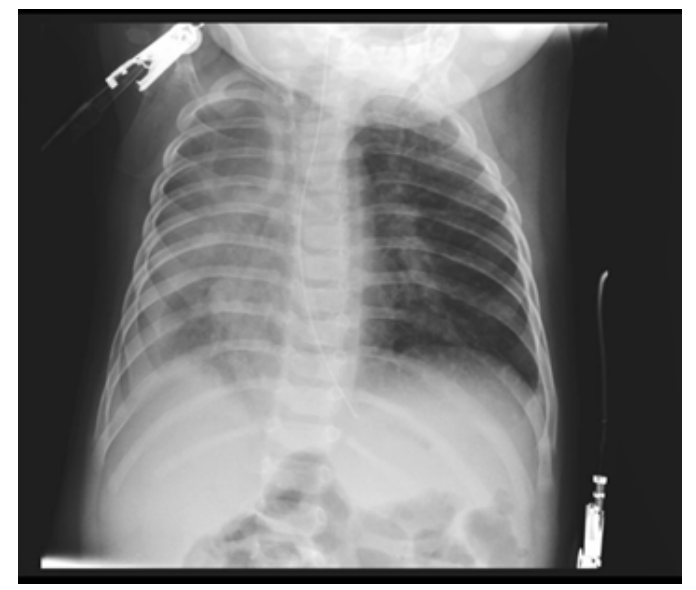
Figure 1 Chest X-ray showing radio opacity of the right hemi thorax of confluent appearance, suggesting an atelectasis process, versus right pulmonary hypoplasia, showed left contralateral lung with increased radius lucidity in relation to compensatory emphysema with contralateral deviation of the cardiac silhouette.

Surgical treatment is reserved for hemodynamically significant cases<sup>15</sup> (Figure 1 & 2).