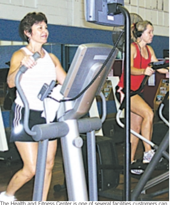
evaluate. Recommendations can be made on building improvements. equipment conditions or even the center's group exercise schedule.

"There may be several requests for a 24-hour fitness facility, which may not be feasible right now, but it could become part of a strategic plan later," Price said. "We strive to work on these comments to make them a reality.