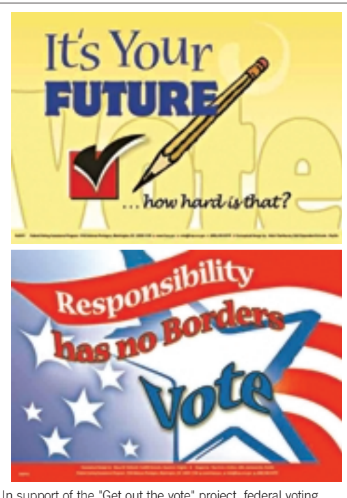
In support of the "Get out the vote" project, federal voting assistance officers are encouraging service members and eligi ble family members, worldwide, to register and vote. Motivational posters feature winning slogans in the 2006 campaign