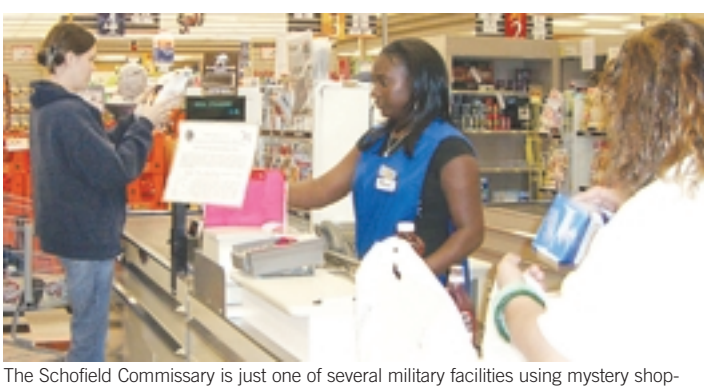
- volunteers who secretly evaluate military facilities or programs. Based upon their recommendations, changes are made to improve patrons' experiences

experience was like, a restaurant's food quality, and/or how the service they received via telephone proceeded, for example, if they called ahead to ask for directions.