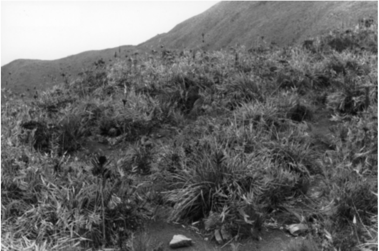
Figure 4. Maquis habitat at Mt Vulcain (950 m asl).