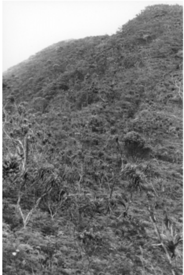
Figure 3. Maquis habitat at Mt Mou (800+ m asl).

Aside from Lioscincus tillieri five other species of New Caledonian skinks have the derived character state of an