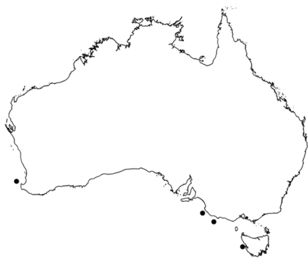
Fig. 3. Locality records for Ebinania australiae.

Distribution . Ebinania australiae is known from southern Australia off the tip of Western Australia (one specimen), off southern South Australia and Victoria (7 specimens), and off Tasmania (one specimen) at 982–1170 m (Fig. 3). The geographically closest congeneric species of Ebinania australiae is E. macquariensis from Macquarie Island, 1500 km southeast of Tasmania, and the next closest species is E. malacocephala from the far southern middle Pacific (54°49.5'S 129°47'W) (both described by Nelson, 1982). Two species, E. brephocephala and E. vermiculata , are known from the Northwest Pacific off Japan. The sixth species of Ebinania , E. costaecanariae is known from the eastern Atlantic off Spain (Quéro, 2001) and Africa (Nelson, 1982).