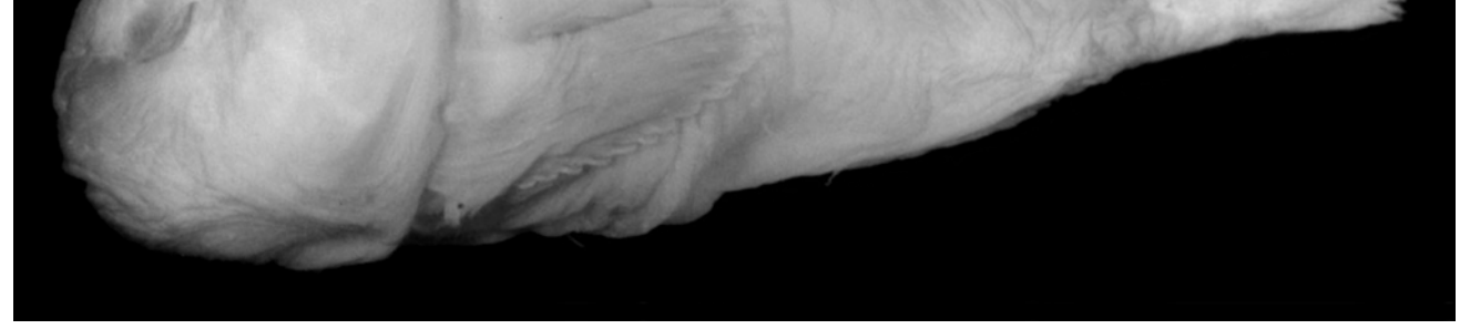
Fig. 1. Holotype of Ebinania australiae, CSIRO T 412, 206 mm standard length. Top: dorsal aspect, bottom: lateral aspect. Scale: 10 mm.