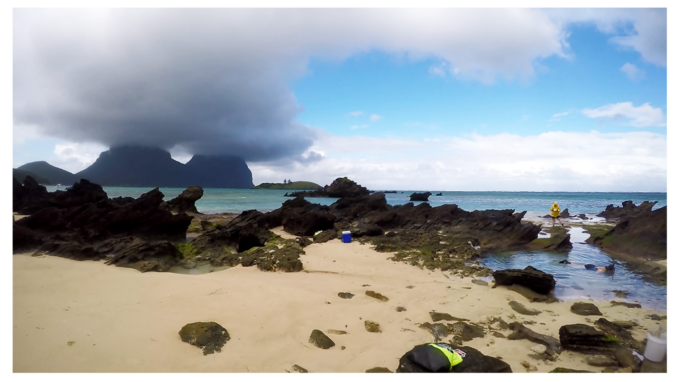
Figure 4. Intertidal marine invertebrate collecting site, Signal Point, as weather influenced by tropical cyclone abates (Alison Miller and Alex Hegedus at the right of the scene).