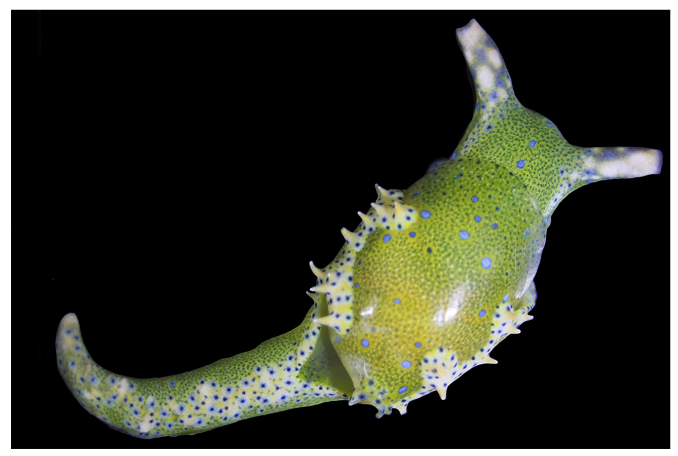
Figure 5. Collected during 2017 Australian Museum Expedition to Lord Howe Island, this bubble snail, Oxynoidae, Oxynoe sp., is camouflaged among the algae on which it feeds.