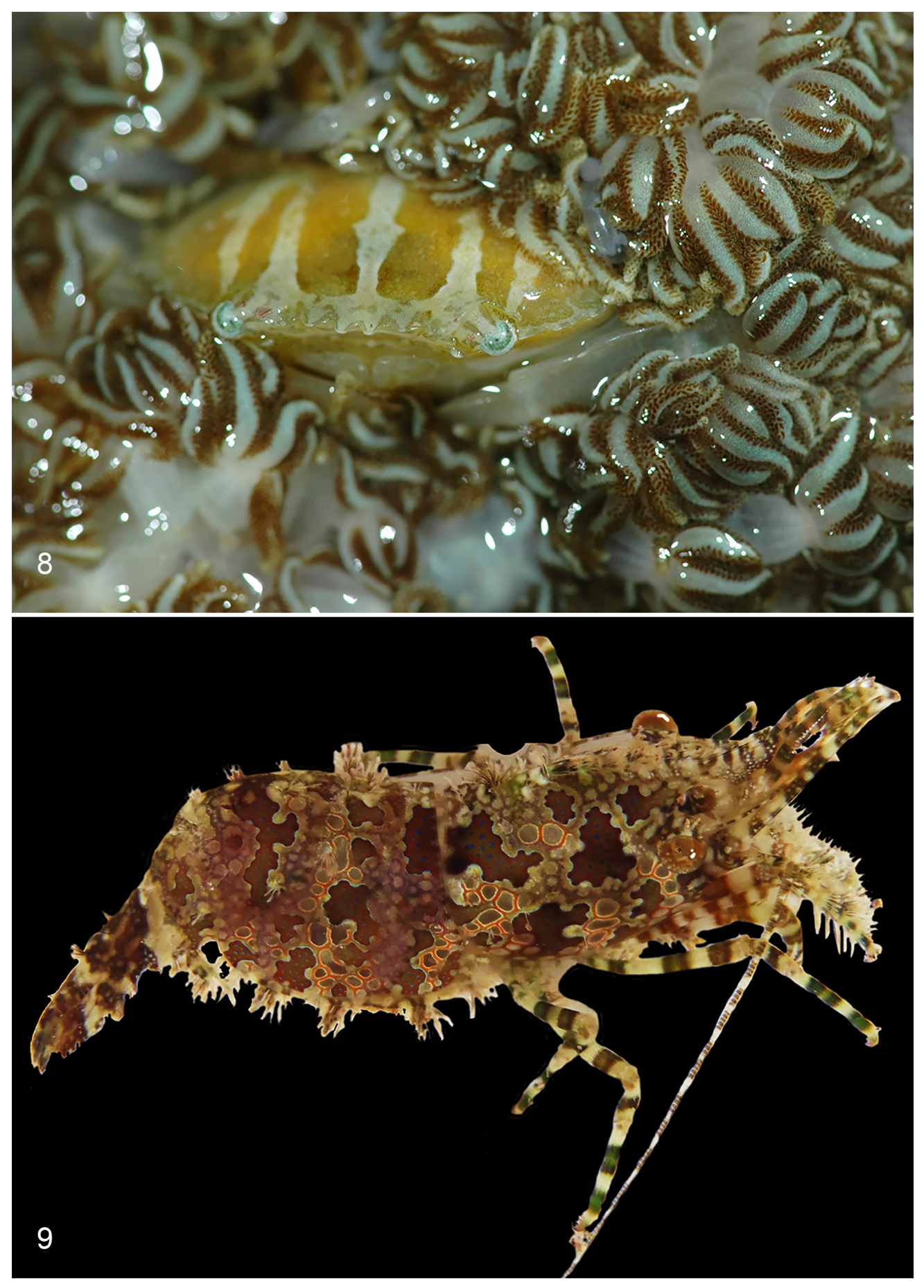
Figures 8–9. Marine invertebrates from 2017 Australian Museum Expedition to Lord Howe Island: (8) crab, Caphyra laevis on host soft coral, Heteroxenia; (9) marbled cleaner shrimp Saron marmoratus.