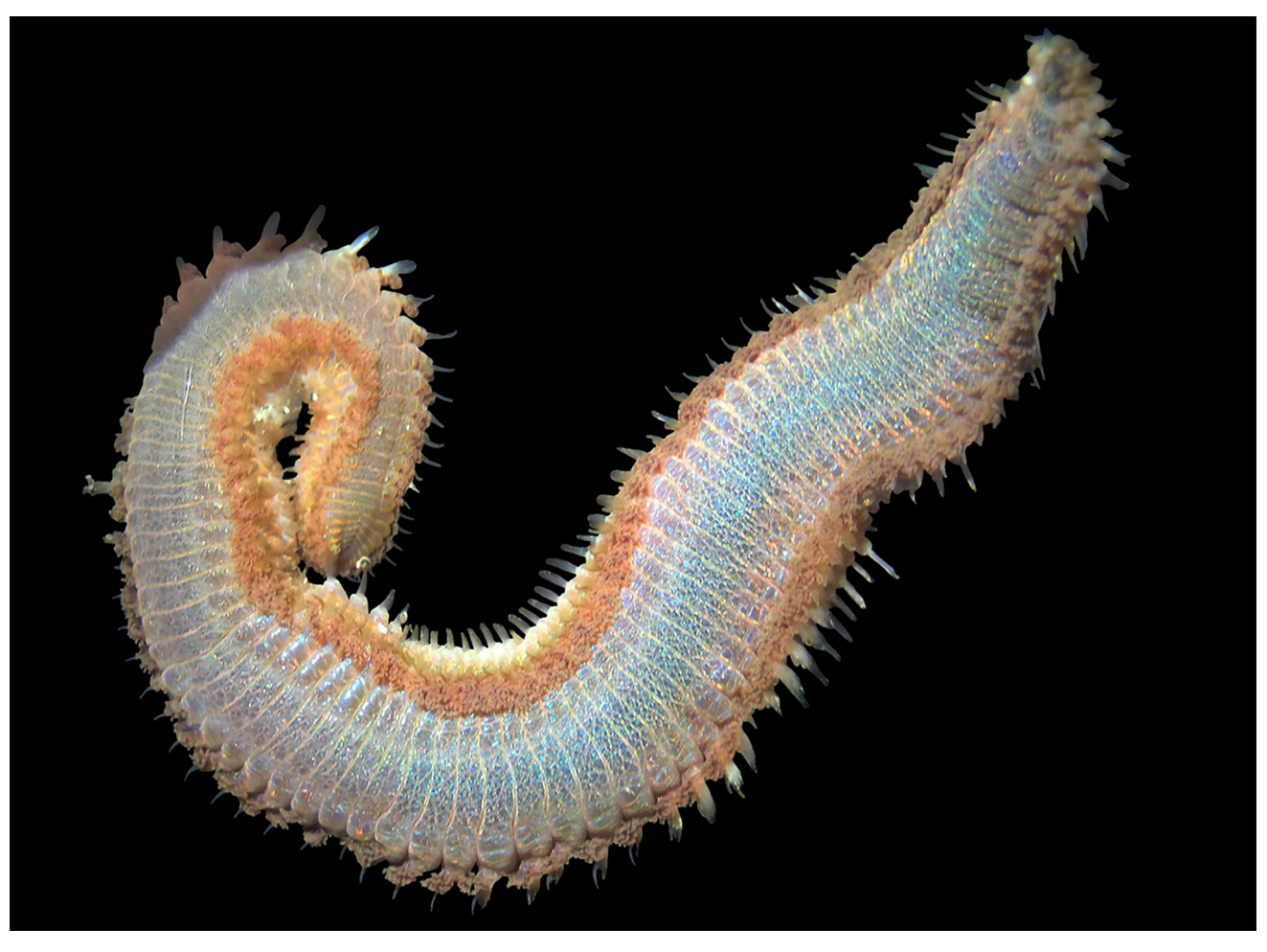
Figure 10. Fireworm, Amphinomidae, Eurythoe.

extracted from all samples but over 30 lots have been sorted into the suborders Asellota (including families Joeropsididae, Munnidae and Stenetriidae), Cymothoida (including species of the superfamily Anthuroidea, Cirolana and Infraorder Epicaridea), Oniscidea and Sphaeromatoidea (family Sphaeromatidae), following the classification recognized in WoRMS (2017). Sphaeromatidae occur in over 25% of the total samples collected, including a wide range of intertidal and subtidal substrates. Asellota occur in at least 15% of the samples whereas other isopod taxa have been found in less than 10% of the sorted collection. Several specimens of Cirolana were obtained in two baited trap samples set in 3-10 m depth in the lagoon and an additional specimen was found in intertidal algae. A single small sample of the oniscidean Actaecia bipleura Lewis and Green, 1994 was collected from the supralittoral area of Lagoon Beach, adjacent to Signal Point, under rocks, and marine and terrestrial plant debris. Reference to the Australian Faunal Directory (ABRS, 2017) and the Atlas of Living Australia (2017) shows Cirolana, Joeropsididae and Stenetriidae to be previously unreported from Lord Howe Island.