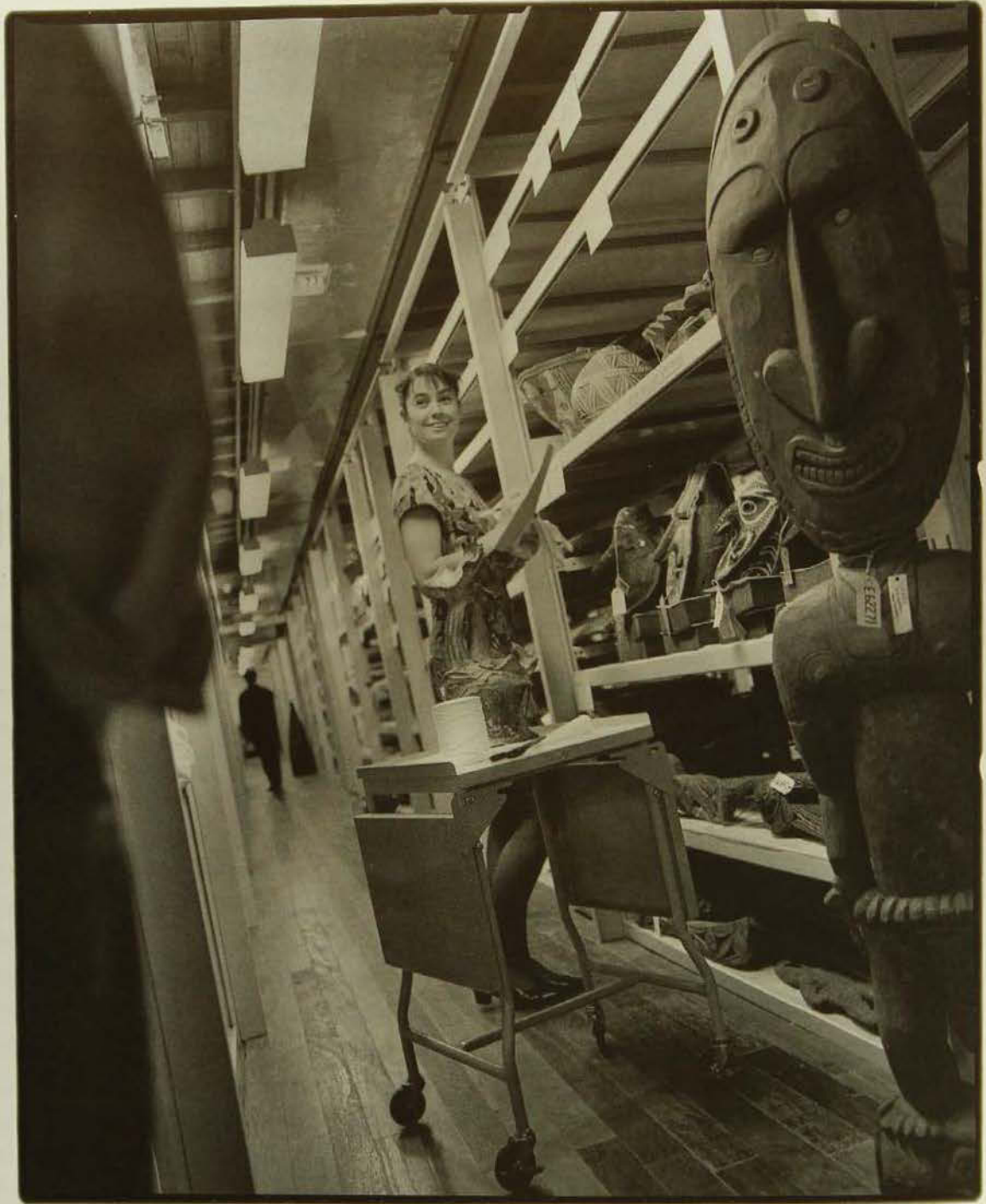
Pacific cultures are represented in the Anthropology collections