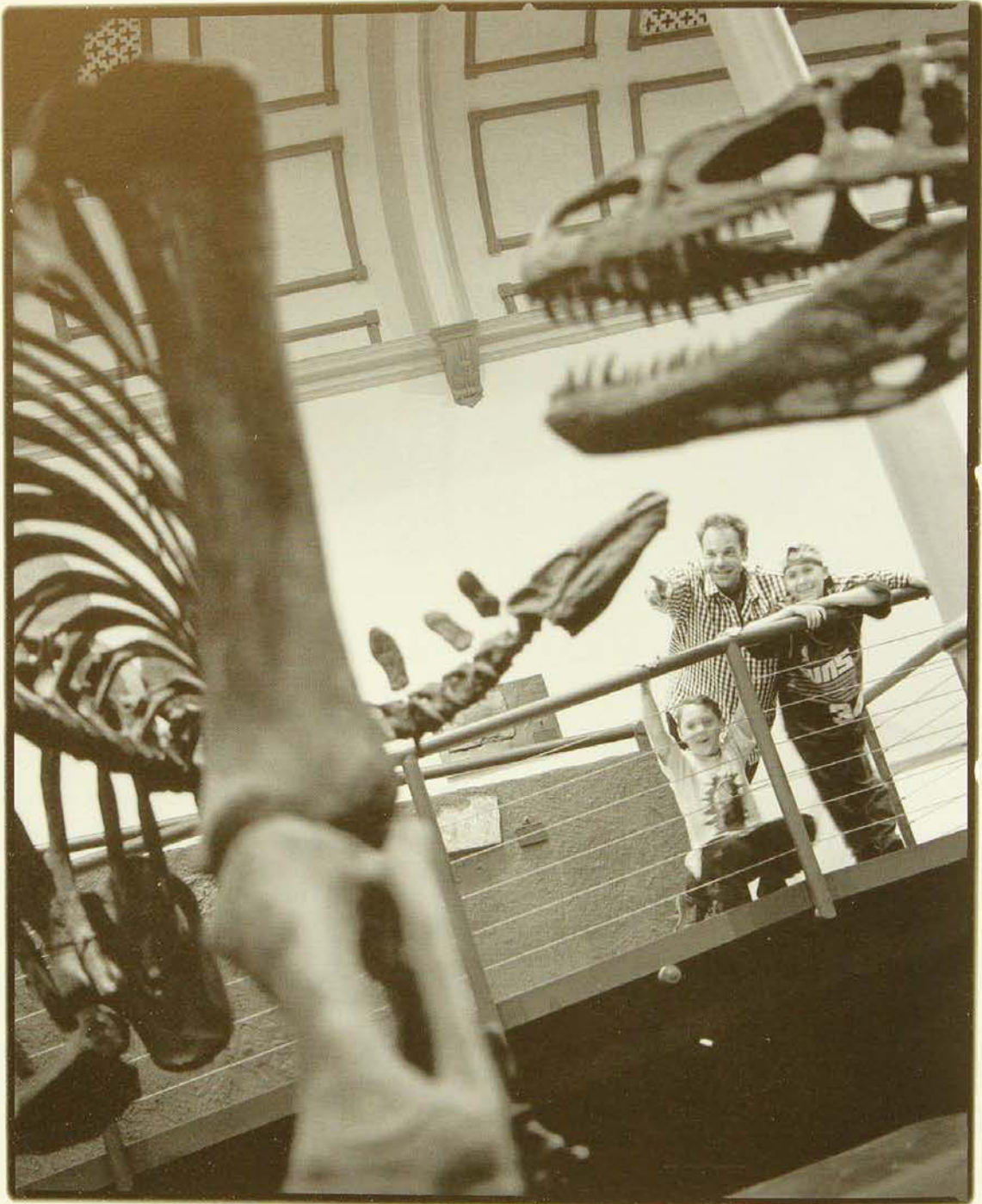
'More than Dinosaurs' exhibition