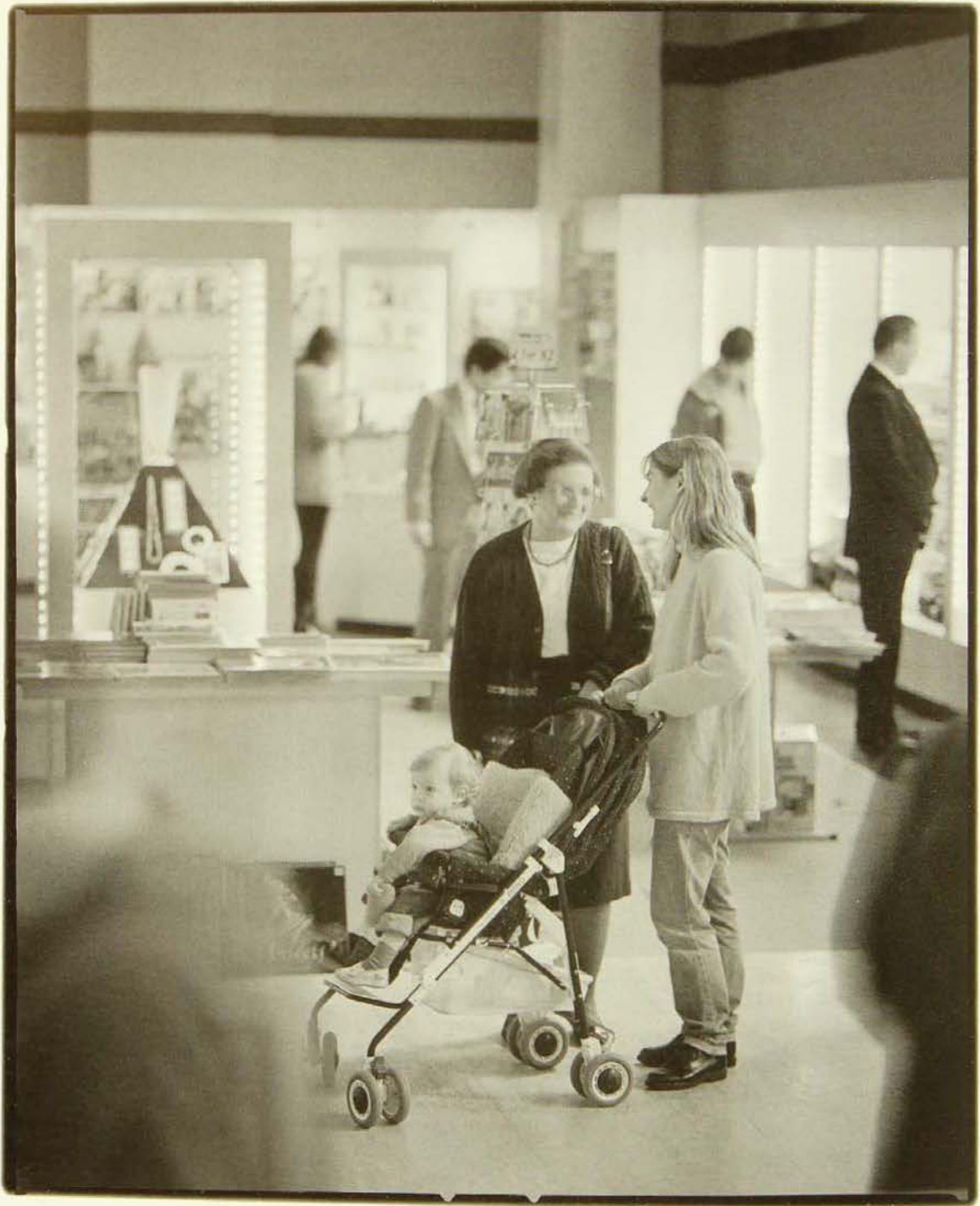
New Museum Foyer and Shop, College Street Entrance