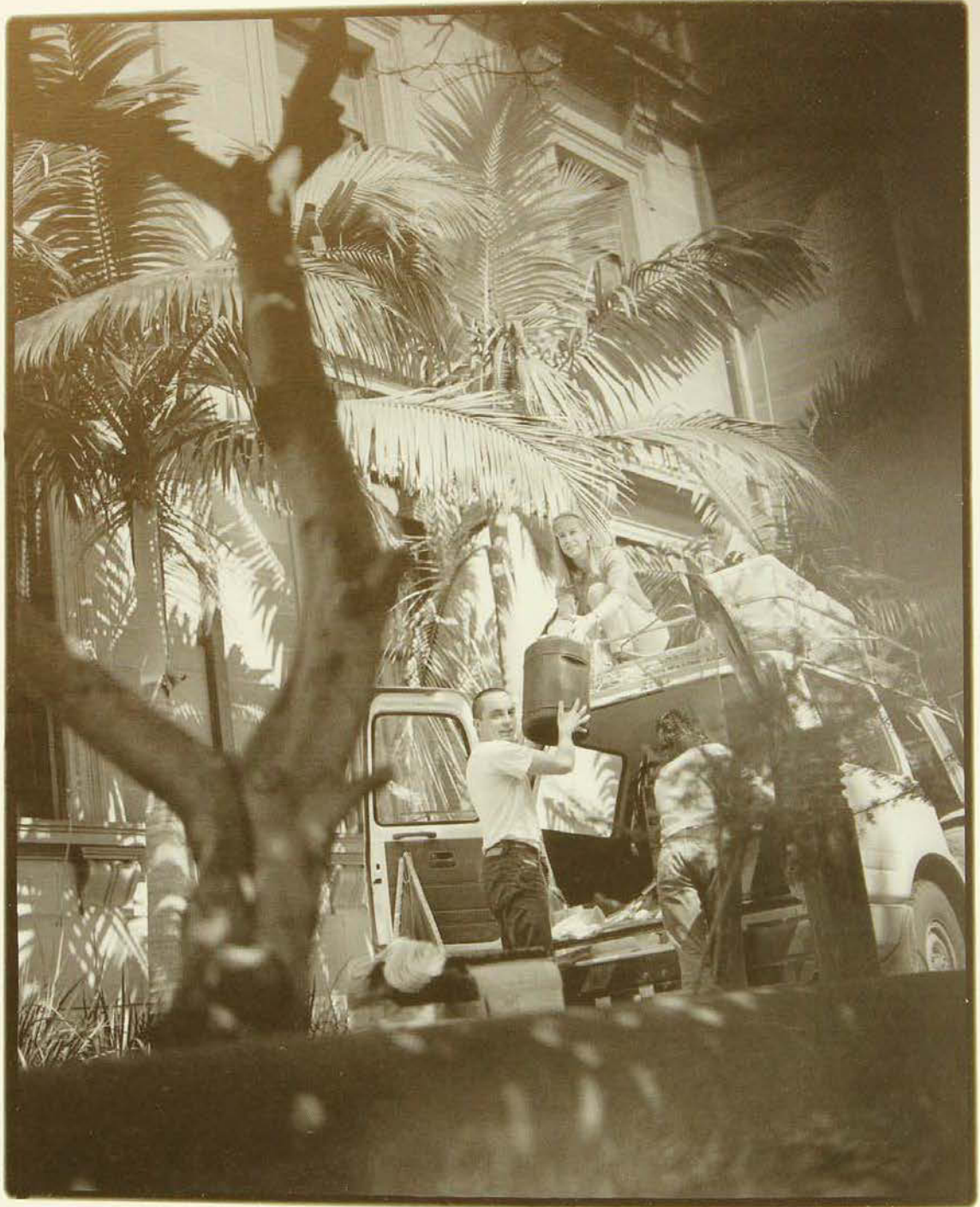
Scientific staff preparing for a field trip