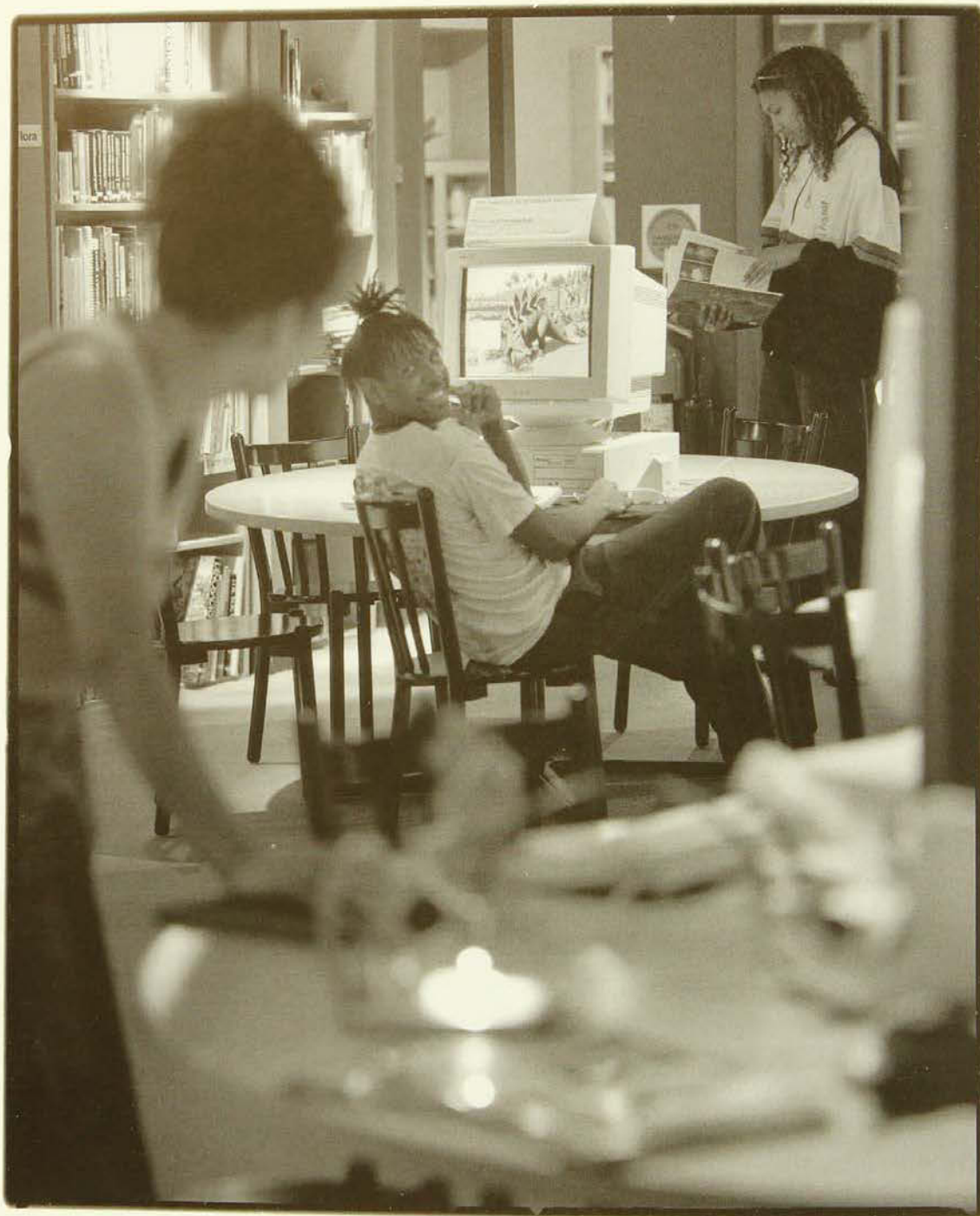
The recently opened 'Search & Discover'