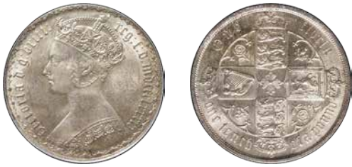
1552) Florin 1886 ESC 863, Bull 2911 UNC with original mint lustre and with gold toning in the legends, a most attractive example with much eye appeal, in an LCGS holder and graded LCGS 78 ( £300 - £400 )