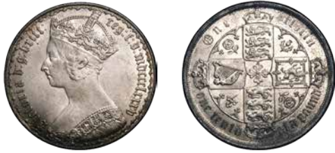
1551) Florin 1884 ESC 860, Bull 2907 UNC with original mint lustre and a hint of golden tone, an extremely attractive example with lots of eye appeal. In an LCGS holder and graded LCGS 78, formerly in an NGC holder and graded MS63, (this ticket no longer with the coin, the information recorded at the time of slabbing) ( £450 - £550 )