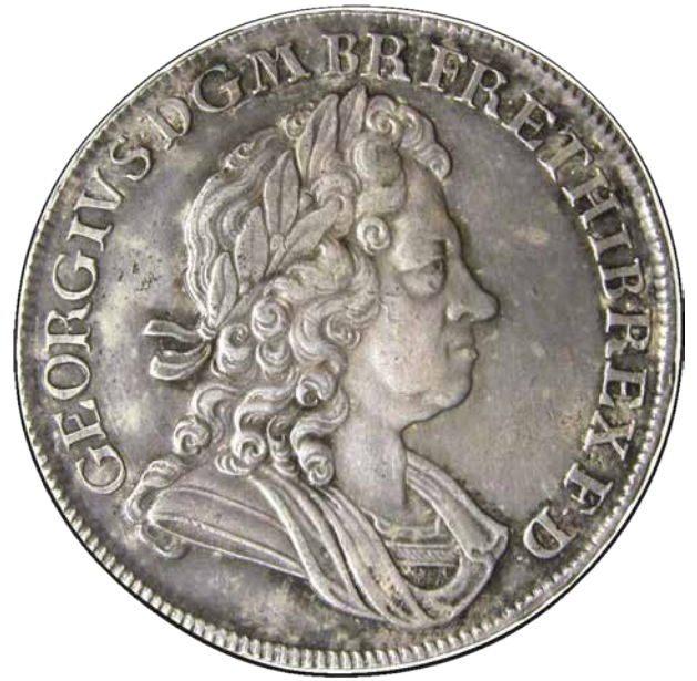
1373) Crown 1716 Roses and Plumes ESC 110, Bull 1540 EF in an LCGS holder and graded LCGS 65 ( £5000 - £5500 )