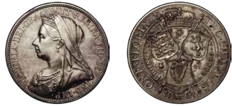
1556) Florin 1893 Proof ESC 877, Bull 2963, Davies 831 dies 2A, First I of VICTORIA points to a rim tooth, UNC the obverse with minor hairlines and contact marks, a deep blue/gold tone over original mint brilliance enhances the considerable eye appeal ( £350 - £500 )