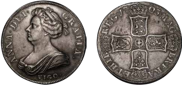
1370) Crown 1703 VIGO ESC 99 Obverse GVF, Reverse VF or better, with a pleasing grey tone, Ex-Spink ( £2000 - £3000 )