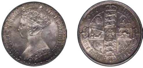
1550) Florin 1885 Longer arcs ESC 861, Bull 2909 Lustrous UNC, in an LCGS holder and graded LCGS 78 ( £250 - £350 )