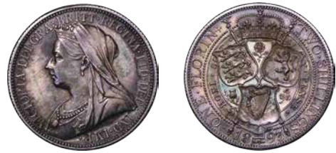
1557) Florin 1897 ESC 881 Lustrous UNC with a light golden tone, slabbed and graded LCGS 82 ( £70 - £95 )