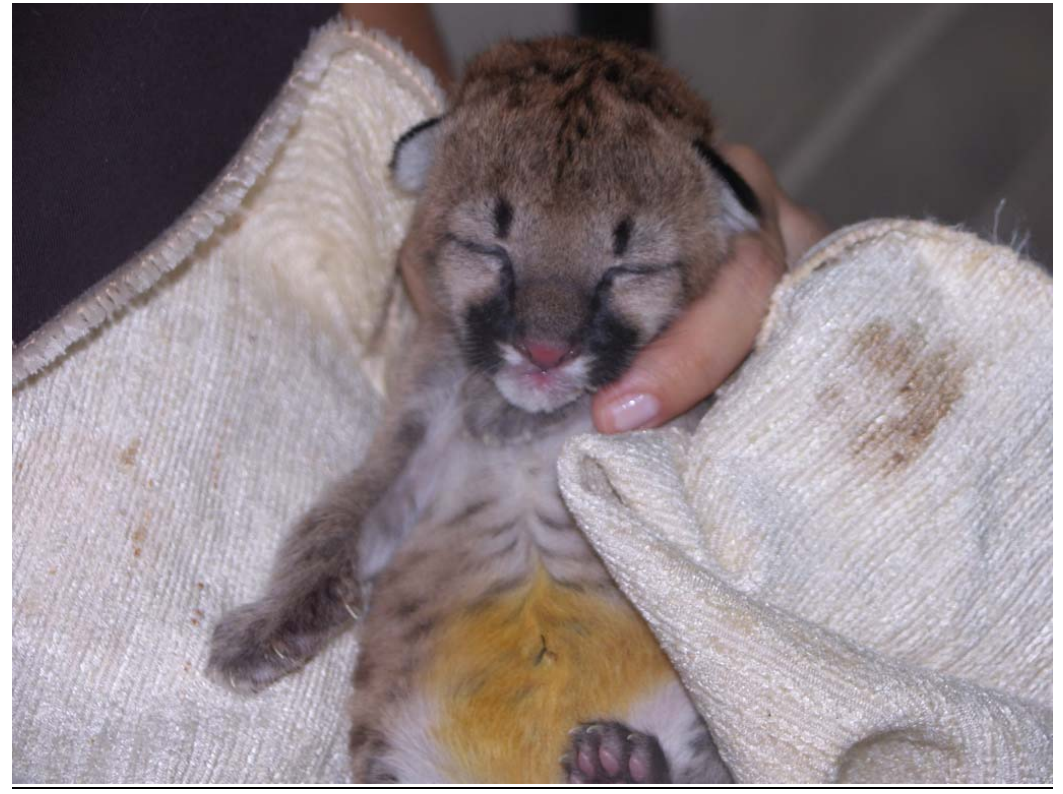
And the very cute( 3 day old Puma cub)