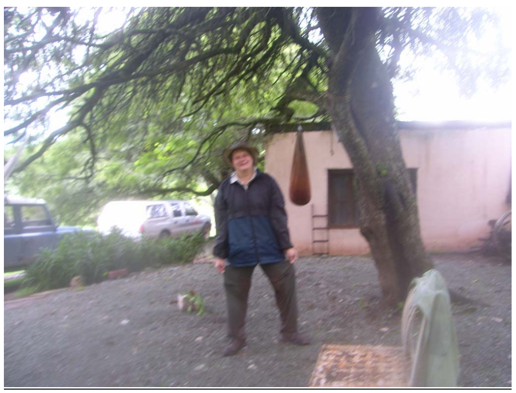
After a 4 hour trip upto 1500ft in tropical storms