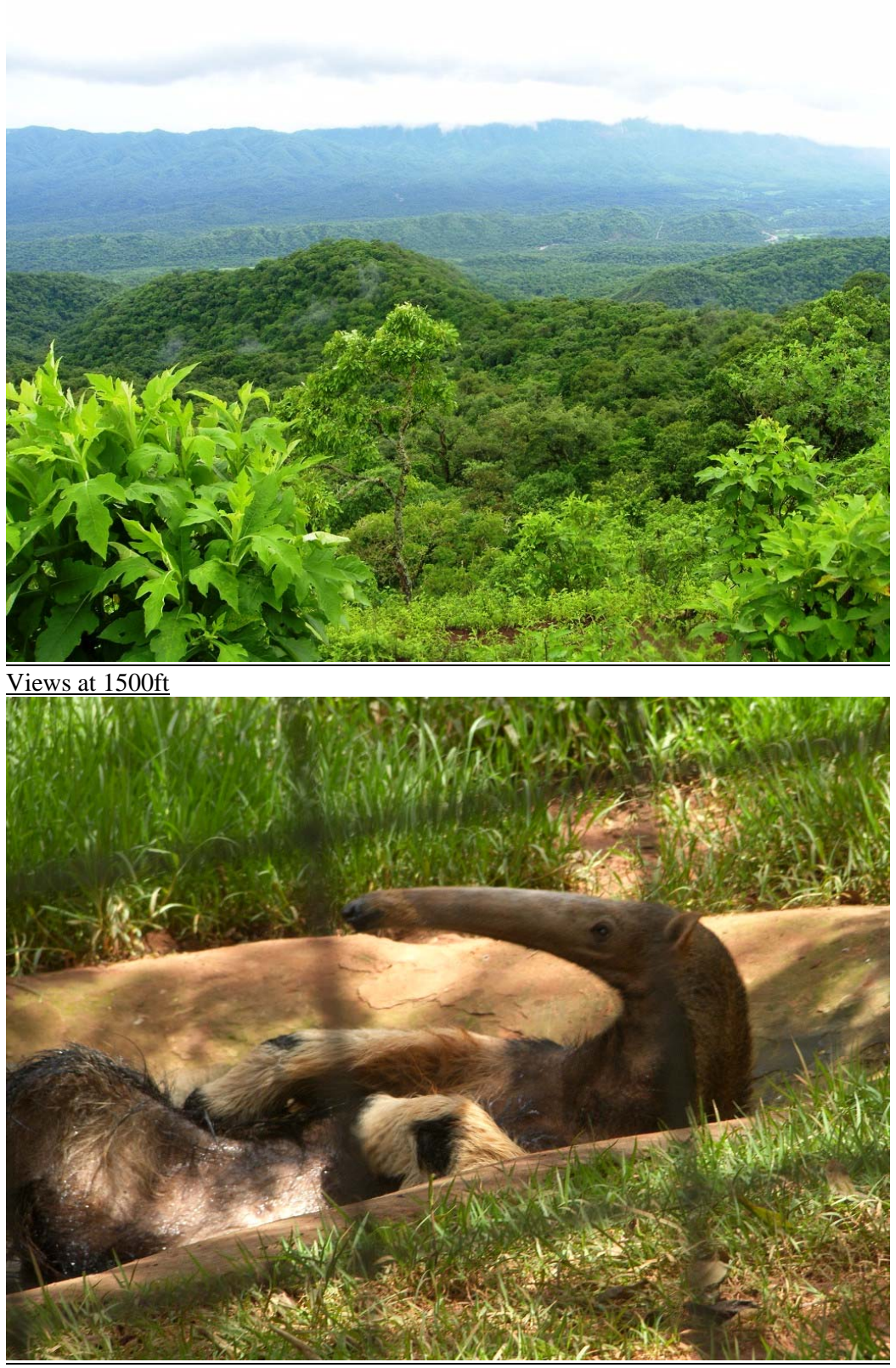
Working with the weird and wonderful