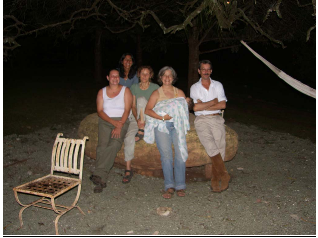
Chasing Toucans San Salvador de Jujuy branch.