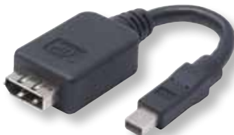
MiniDP to DP adapter (sold separately)

Important: When using mini DisplayPort-to-singlelink DVI adapters, quad output is divided into two pairs (displays 1 and 2, and displays 3 and 4). The displays used in each pair must be identical (with the same manufacturer and model number) and must be identically configured (with the same resolution). The pairs do not have to be identical to each other, however.