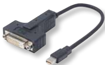
MiniDP to DVI adapter (included in the box)