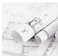
CAD drawings (color and black-and-white)

You can use the HP DesignJet T7200 Production Printer to print any combination of applications on a wide range of media from bond paper to glossy photo paper for maximum versatility including: