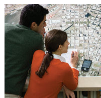
Maps and orthophotos