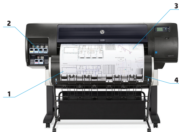
HP DesignJet T7200 Production Printer