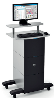
HP SmartStream software