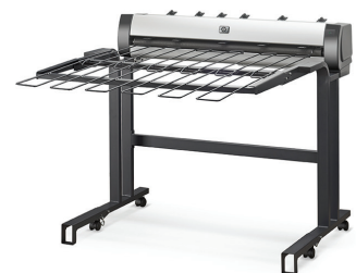
HP DesignJet Stacker