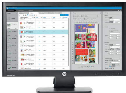
HP SmartStream software

The HP DesignJet T7200 Production Printer is ideal for repro houses, central reprographics departments (CRDs), and enterprises looking for correct and easy PDF management that want to boost overall print production and decrease total cost of ownership by increasing efficiency and confidently managing PDFs with HP SmartStream software.