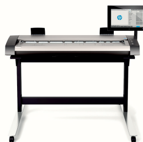
HP DesignJet HD Pro Scanner