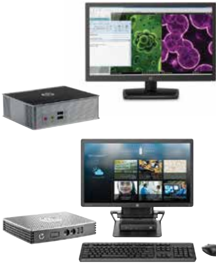
Monitor, keyboard, mouse, and integrated work center stand are sold separately

Enjoy rich multimedia performance, enterprise level data security, simplified management, and lower costs with HP Thin Clients.