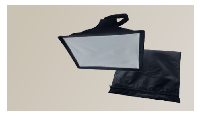
Mini soft box SB 30-30