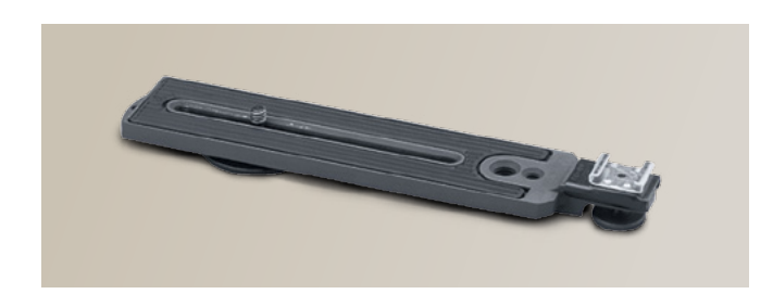
Camera rail 40-36