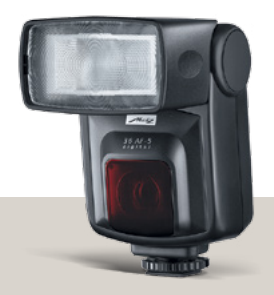
20 mecablitz 36 AF-5 digital