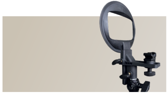
Flash unit holder FGH 40-60