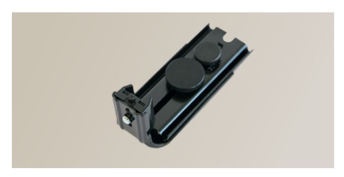
Rail adapter 60-28