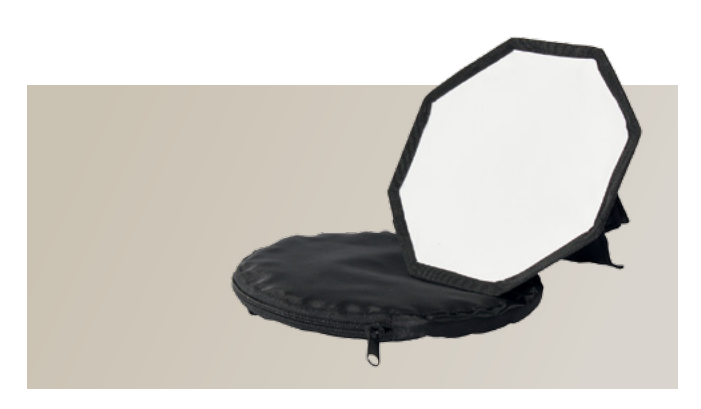
Mini Octagon soft box SB 34-34