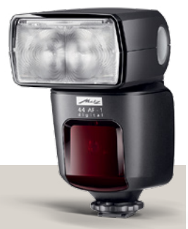
16 mecablitz 44 AF-2 digital