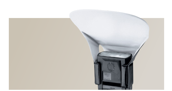
Reflector umbrella 76-23

(for numerous Metz, Canon and Nikon flash units)*