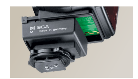
SCA 3102 adapter

SCA 307 A connection cable between adapter SCA 300 on the camera's flash shoe and the Metz flash unit on the camera rail