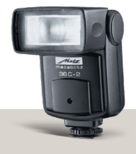
28 mecablitz 36 C-2