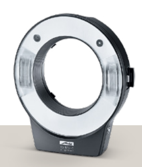
26 mecablitz 15 MS-1 digital-Kit