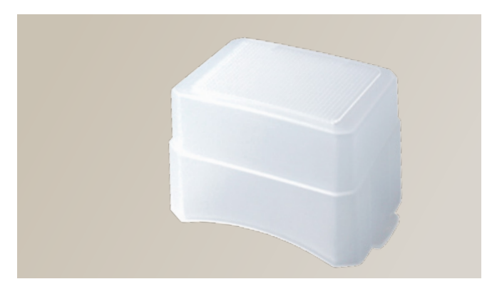
mecabounce Diffuser for compact flash units