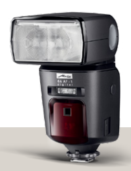
12 mecablitz 64 AF-1 digital