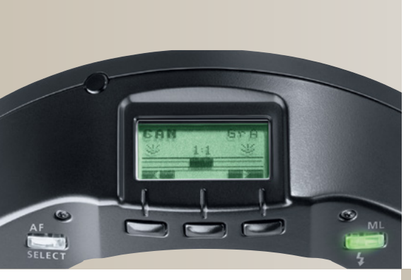
Simple operation with the dot matrix display.

The Metz mecablitz 15 MS-1 digital provides wireless macro flash via two individually-controlled reflectors. In doing so, the innovative macro flash ring guarantees balanced, precision illumination whilst opening up new creative possibilities for macro shots. With the help of individually variable reflectors (o°–20°) and their precision light distribution, individual creativity really does have full rein. Creating effective light accents has never been so easy, regardless of the subject. And all this with superior convenience of use – after all, the Metz mecablitz 15 MS-1 digital automatically provides the right level of light both reliably and with precision – all thanks to wireless TTL* operation. Over and above this is a clear dot matrix display which serves to make operation of the mecablitz 15 MS-1 digital even easier. Anyone looking for even more creative latitude can fall back on the manual controls on the new mecablitz 15 MS-1 and vary the prescribed light output via the six partial light output settings. Space-saving internal (rechargeable) batteries provide efficient power supply.