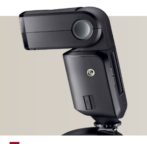
Connection friendly, thanks to an integrated sync cable socket.