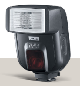
21 mecablitz 24 AF-1 digital