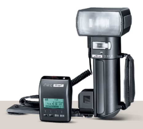
24 mecablitz 76 MZ-5 digital