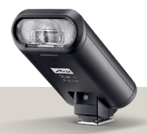
18 mecablitz 26 AF-2 digital