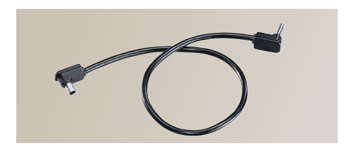
Standard sync cable 36-50