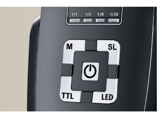
Clear and easy to operate.