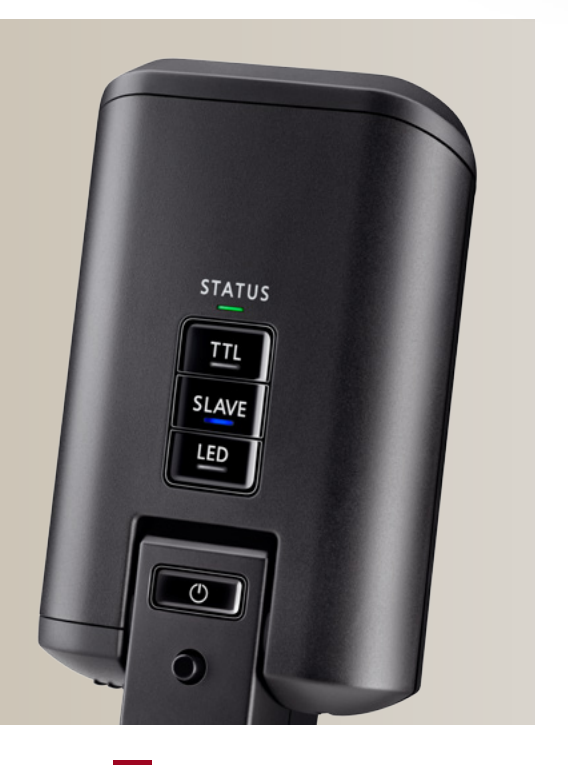
Simple and intuitive operation – ideal for flash novices