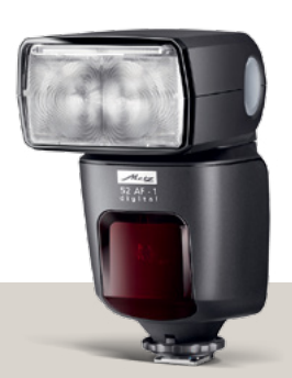
14 mecablitz 52 AF-1 digital