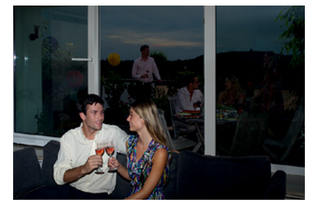
with or without slave flash mode

Slave flash mode is perfect for particularly creative lighting design. This involves the positioning and use of an external flash unit wherever required, and entirely without the need for a cable. This can create interesting light accents — or with the use of several slaves the split lighting of subject and background.