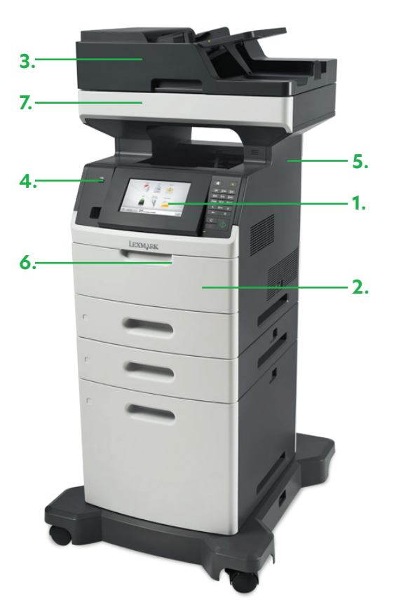
XM5163 model with 550-sheet tray, 2100 sheet tray and caster base

Print on a wide range of media wiht built in 2-sided printing. Add additional input capacity to 3300 pages for higher volume printing needs.