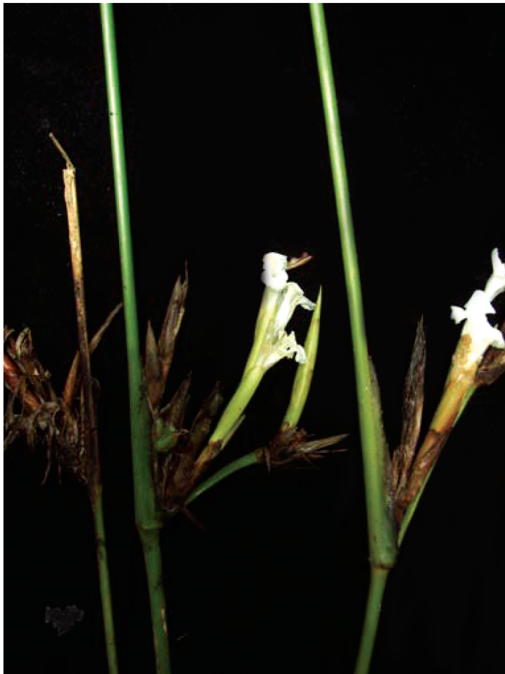
Fig. 1. Phrynium longispicum (Warb. ex K. Schum.) Suksathan & Borchs. Photograph of Poulsen et al. 2815 (the neotype).

Notes. Both syntypes cited in the original description of the species are lost. As neotype we have chosen a recent collection with both flower material in alcohol and fruits ( Poulsen et al. 2815 ) from Boyong; the same locality as one of the syntypes, Warburg 15739 . This neotype well agree with the protologue of the species. Phrynium longispicum was included in the phylogenetic study by Suksathan and Borchsenius (2009) under the accession name Phacelophrynium sp. 1 (DNA extracted from the specimen Vogel & Vermeulen 6721 , L). The results show that P. longispicum is