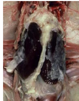
Figure 2: Perihepatitis

Pericarditis, characteristic of colisepticemia, is frequently observed and may be associated with myocarditis. The pericardium becomes cloudy and edematous. Initially, fluid and soft masses of pale exudate accumulate within the pericardial sac, followed by fibrinous exudate. With the progression of the disease, the exudate increases, becomes more cellular and undergoes marriage. (Nolan et al. , 2013). Then, the inflamed adherent pericardial sac undergoes organization (fibrosis), resulting in constrictive pericarditis and heart failure. Fibrous perihepatitis and splenomegaly with necrotic tissues in the liver and spleen may be evident.