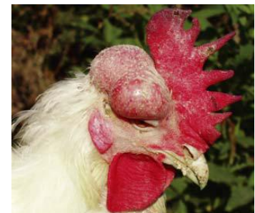
Figure 1: Swollen Head Syndrome; Source: Nolan et al. , 2015

An acute to subacute form of cellulitis that affects the subcutaneous tissues of the periorbital area, giving a swollen appearance to the chicken's face, is swollen head syndrome. Swelling of the head is caused by inflammatory exudate under the skin that accumulates in response to bacteria, usually E. coli , after viral infections of the upper respiratory tract, such as avian metapneumovirus, infectious bronchitis virus, etc. (Nolan et al. , 2013) and is worse in flocks exposed to high levels of ammonia in the air (Nolan et al. , 2015). Mainly broilers and their parents are affected, characterized by the swollen appearance of the face, respiratory symptoms (coughing and sneezing), tracheitis, opisthotonus, green diarrhea with a foul odour (Vegad, 2015).