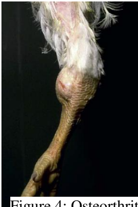
Figure 4: Osteoarthritis; Source: Nolan et al., 2015

Colisepticemia is defined by the presence of virulent E. coli in the bloodstream of birds. The duration, degree and outcome of the disease plus the pattern and severity of the lesions are determined by virulence and the number of organisms, balanced with the effectiveness of the host's defenses. The most common form of colibacillosis is characterized by an initial respiratory infection (air sacculitis), often followed by a generalized infection (perihepatitis, pericarditis and septicemia) (Mellata et al. , 2003). Colisepticemia progresses through the following stages: acute septicemia, subacute polyserositis and chronic granulomatous inflammation (Nolan et al. , 2013).