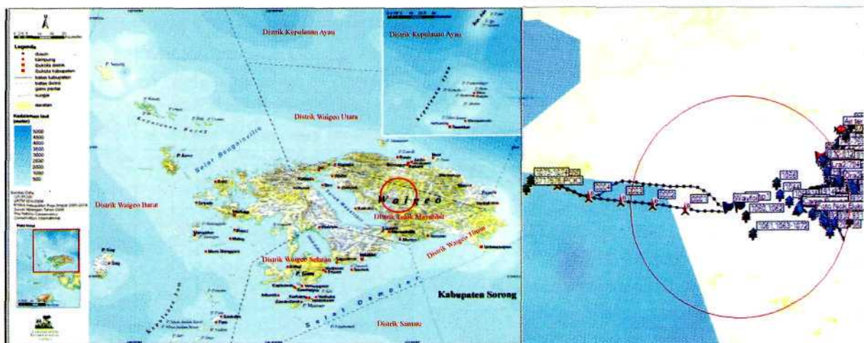
Figure 1. Map of Waigeo Island, left figure (source: RTRW Kabupaten Raja Ampat 2005-2014, Survei Lapangan Tahun 2006, The Nature Conservancy and Conservation International Indonesia) and the detail sites studied in the island, right figure (green tree symbols). Coordinates and elevations of all sites (localities) observed were recorded. Waifo village is located at the center of the red circle.

The study area was focused on Kamtabae River (the Waifo Forest) located within the East Waigeo Island Nature Reserve, the Raja Ampat Islands (West Papua), at altitudes range from 20 to 630 m above sea