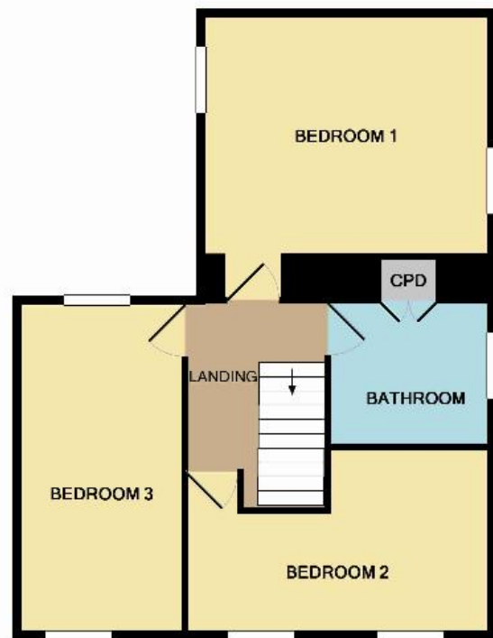
1ST FLOOR APPROX. FLOOR AREA 579 SQ.F.T. (53.8 SQ.M.)