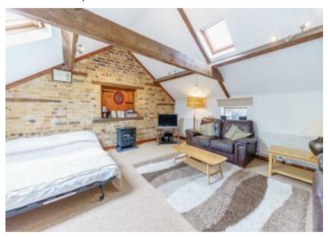
Rear Entrance Hall with door to garden, laminate flooring, broom cupboard

Living Room 15'1" x 14'10" (4.6 x 4.51) With vaulted ceiling, exposed brick walls, 2 windows, velux window, 2 radiators