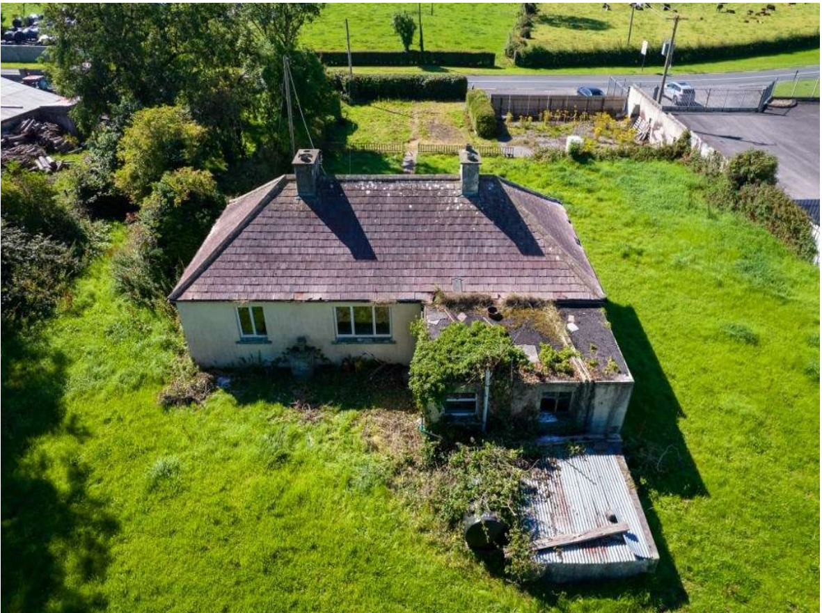
Lissacarrow, Fuerty, Co. Roscommon. F42 W229