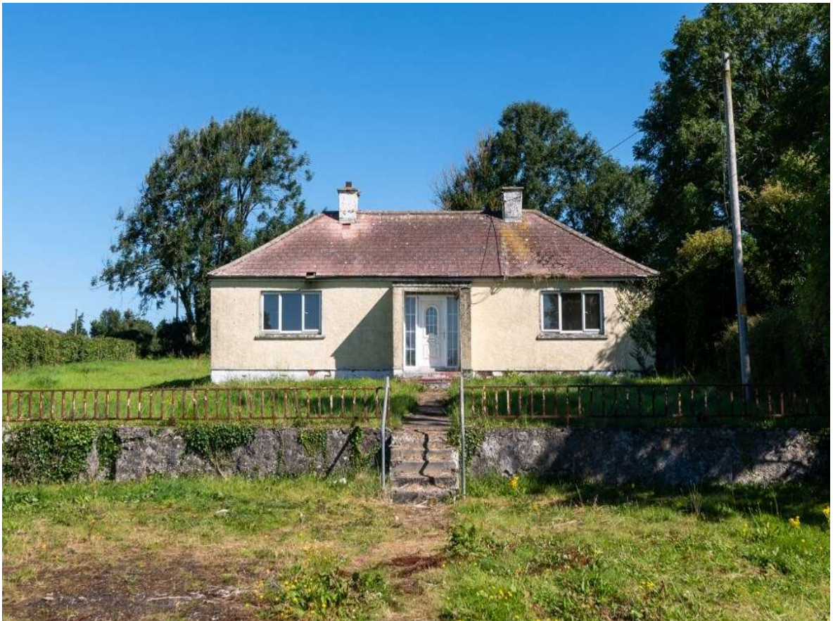
Lissacarrow, Fuerty, Co. Roscommon. F42 W229