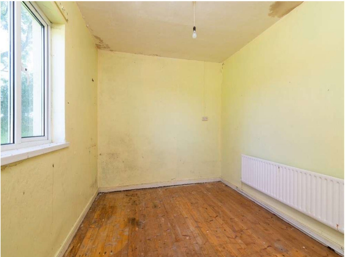
Lissacarrow, Fuerty, Co. Roscommon. F42 W229