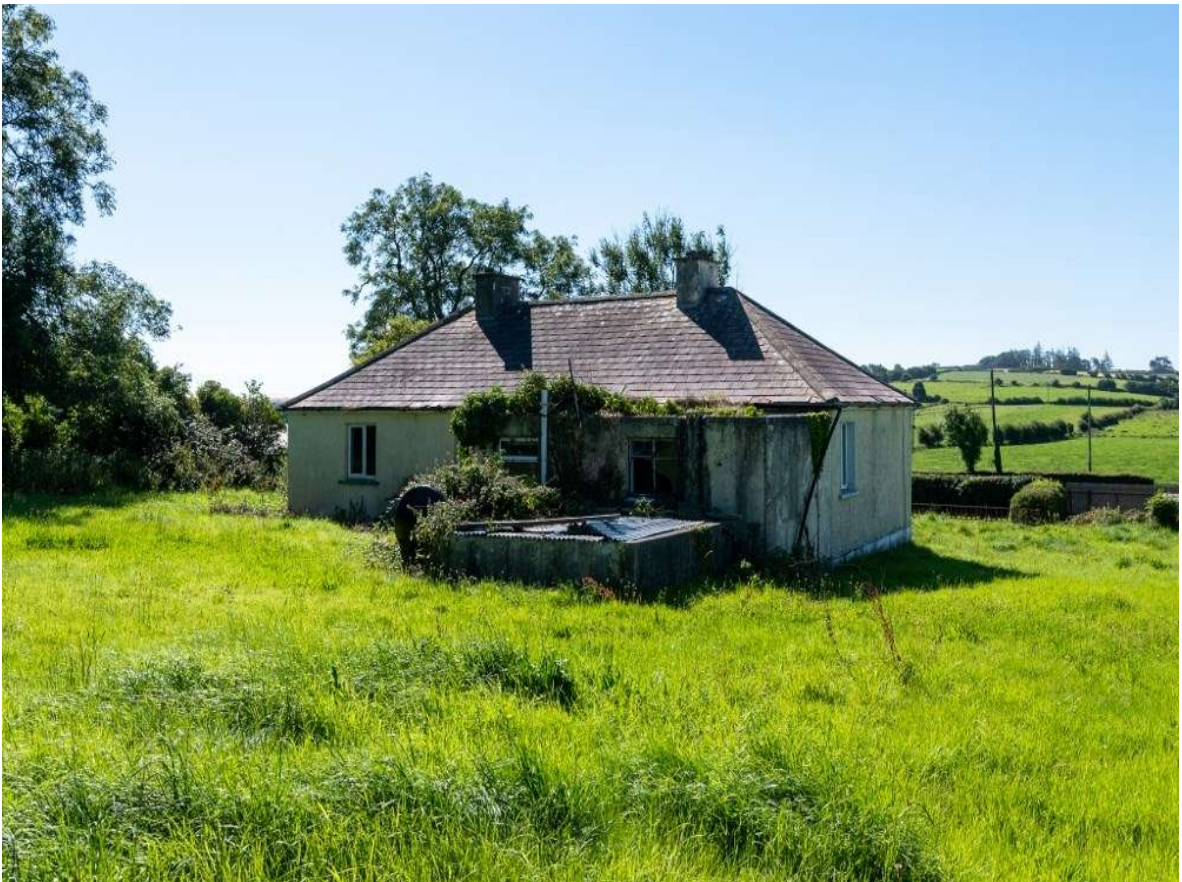
Lissacarrow, Fuerty, Co. Roscommon. F42 W229