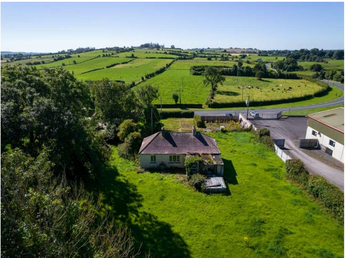
Lissacarrow, Fuerty, Co. Roscommon. F42 W229