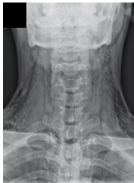
Figure 3: Neck radiograph in AP view showing significant subcutaneous emphysema

Among precipitating factors of Hamman's syndrome were alcohol excess, vomiting, coughing and illicit drug use (2) Some may be idiopathic. This syndrome is also