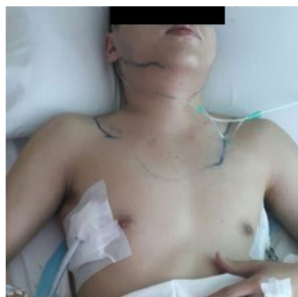
Figure 1: Picture of the patient with significant swelling of the neck

to the neck region (Figure 1). There was no stridor or distended vessels seen.