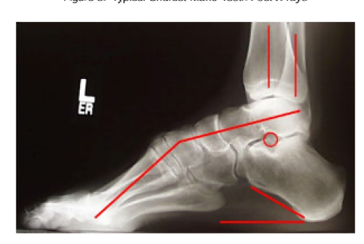
Figure 3: Typical Charcot-Marie-Tooth Foot X-rays