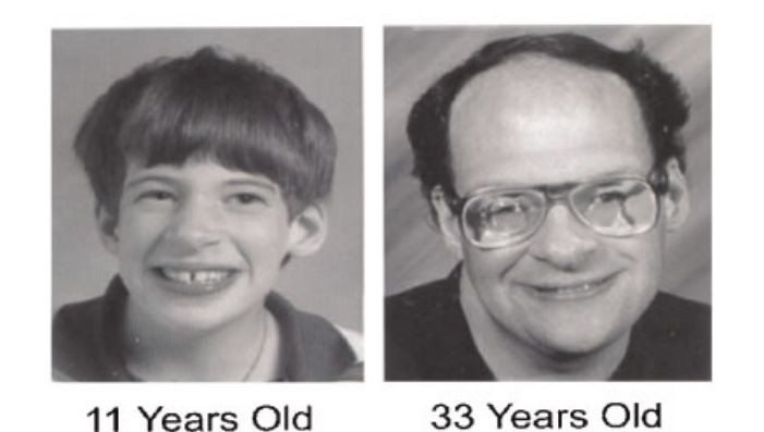
Fig. 2. Picture of male with 49,XXXXY from childhood to adulthood. Note the change in physical appearance with age.