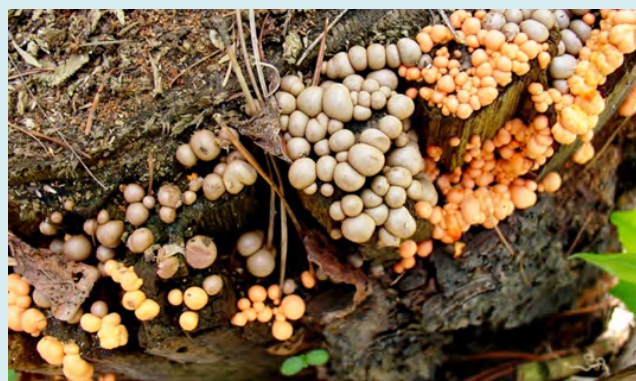
Figure 1: Lycogala epidendrum on an unidentified stump.

along the Battery river, 14.08.1946, M.N. Kuznetsova; 09.08.1948, S.R. Schwartzman; 21.08, 27.09 и 07.10.1958, I.N. Golovenko; ib., Shaggy hill, 28.08.1948, S.R. Schwartzman; ib., headwaters of the Kazachka river, 16.08.1958, I.N. Golovenko; ib., heads, 28.08.1959, I.N. Golovenko; ib., Gorelnik, 01.08.1959, I.N. Golovenko; BAG, below the lake, 12.06.1949, I.N. Golovenko; ib., spruce forests, 13.08.2009, Y.V. Rakhimova; PG, 21.06.1951, 23.09.1958, I.N. Golovenko; Talgar gorge, 06.09.1958, I.N. Golovenko; 07.07.1967, I.N. Golovenko; TG, heads, 09.10.1964, I.N. Golovenko; on Populus tremula L., SAG, Shaggy hill, 11.08.1948, S.R. Schwartzman; 20.08.1958, I.N. Golovenko; ib., tree nursery, 13.10.1954, ib., spruce forests along the Battery river, 21.08, 27.09, 07.10.1958, I.N. Golovenko; on an unidentified stump, BAG, lowland, 06.2011, Y.V. Rakhimova.