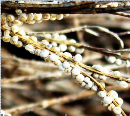
Figure 2: Diderma niveum on Artemisia juncea