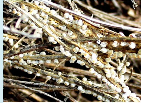
Figure 3: Diderma niveum on Artemisia juncea