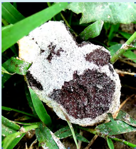
Figure 4: Fuligo candida on Poaceae.