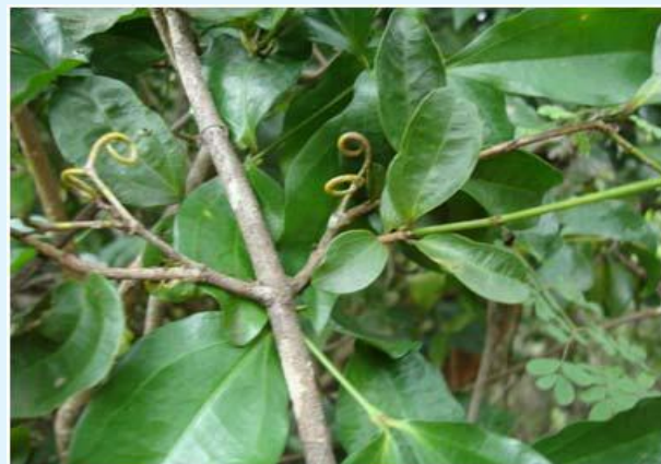
Figure 1: Inclusion scheme of the patients in the study.

anthelmintic activity in pherithima posthuma . All the concentration prepared was paying dose dependent anthelmintic activity.