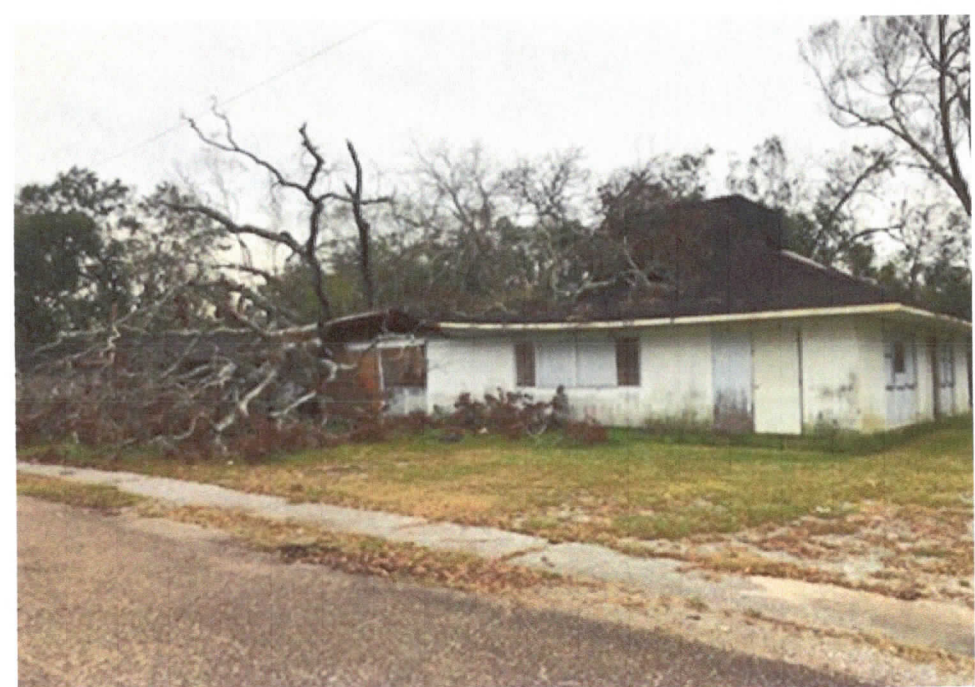
906 Greene St.