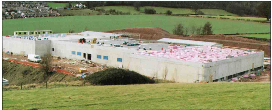
The new Data Centre takes shape at Mitcheldean. On the right can be seen the pink-wrapped material being used to seal and insulate the roof, which will in due course be grassed over.

Work is now well under way at the new Data Centre at Mitcheldean, which we featured in the August 1992 Newsletter. Despite recent bad weather, the design-and-build contractor, Wates Integra, now has the concrete shell of the Centre in place. Internal work is also progressing well and the first phase of landscaping will commence shortly – in all, some 140 semi-mature trees and 7,000 small trees and shrubs will be planted on the site. Wherever possible, local contractors are being employed on the project. Wates Integra will hand over the building to Rank Xerox for specialist fitting-out work to begin in the autumn.