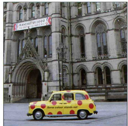
One of Rank Xerox's colourful cabs lends support to the Manchester 2000 Olympic bid.